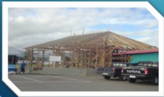
New Fish Market Building successfully completed in 2014 funded by Ministry of Local Government