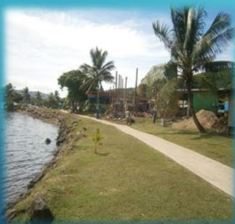
Back in 2015

- This project was undertaken by Savusavu Tourism Association (STA) & Savusavu Town Council in 2015.