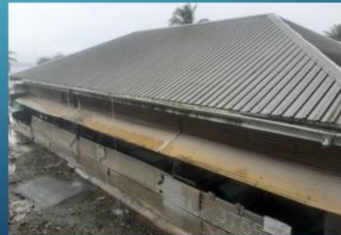
Current state of the Fish Market Building