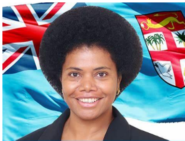
Hon. Lenora Qereqeretabua Deputy Chairperson Deputy Speaker of Parliament Assistant Minister for Foreign Affairs