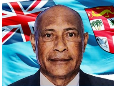
Hon. Viliame Naupoto Chairperson of the Standing Committee on Foreign Affairs and Defence

Pursuant to Standing Order 109(2)(e) the Standing Committee on Foreign Affairs and Defence is mandated to look into matters related to Fiji's relations with other countries, development aid, foreign direct investment, oversight of the military, and relations with multi-lateral organizations. The members of the Standing Committee on Foreign Affairs and Defence are as follows: