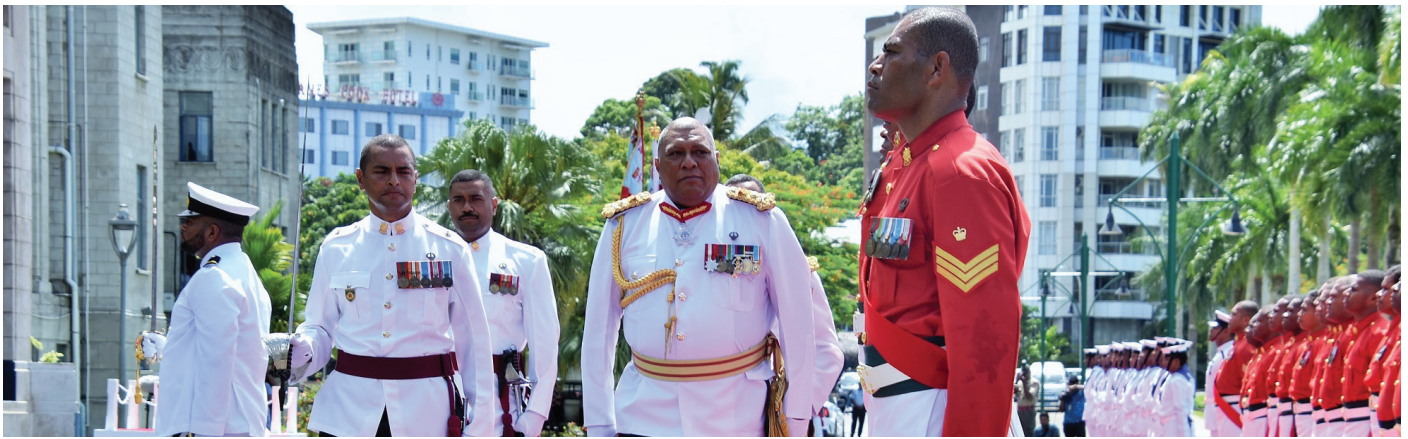
President of the Republic of Fiji, H.E. Ratu Wiliame Katonivere inspects the guard-of-honour by the Republic of Fiji Military Forces.

and people with disabilities. There are renewed efforts to revive the sugar industry which provides a livelihood for a fair share of our population, particularly farmers and landowners.