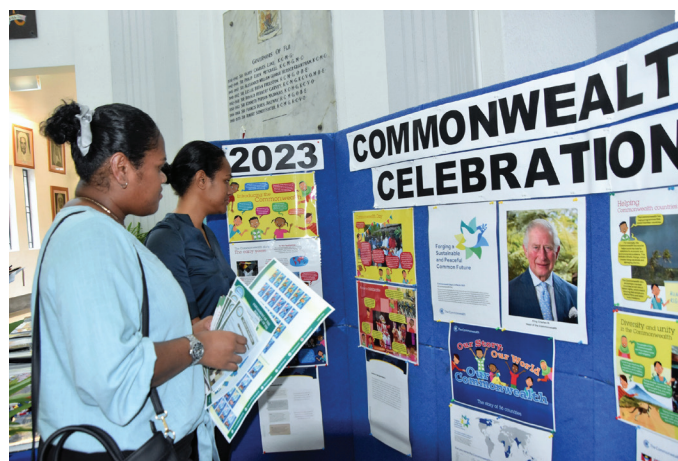
Students looking through the items on display to mark Commonwealth Day.