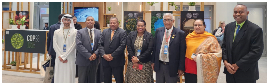
Fiji Parliament delegation at the COP 28 booth in Manama, Bahrain.

A Parliamentary delegation led by the Speaker of Parliament Hon. Ratu Naiqama Lalabalavu attended the 146th Inter-Parliamentary Union ('IPU') Assembly in Manama, Kingdom of Bahrain. The delegation included the Assistant Minister for Tourism and Civil Aviation Hon. Alitia Bainivalu and Opposition Member Hon. Inia Seruiratu. The IPU Assembly and its related meetings commenced on Saturday, 11 March 2023. The IPU Assembly provides an opportunity for the global community of national Parliaments to come together to strengthen Parliamentary efforts to drive change and address global issues. The theme of the 146th Assembly is Promoting peaceful coexistence and inclusive societies: Fighting intolerance. At the 146th Assembly, the Honourable Speaker addressed the plenary during the General Debate at the Special accountability segment on IPU action to tackle climate change. The Hon. Speaker stated that climate change affects us all and as members of the Pacific Small Islands Developing States (PSIDS), Fiji is not immune. "Climate change affects us disproportionately, however, the PSIDS are threatened by rising sea level, ocean warming and acidification, increased frequency and intensity of cyclones, changing weather patterns particularly rainfall that causes serious flooding." "As a small island state, Fiji has a strong engagement and commitment with the UNFCCC under the Paris Agreement punching above its own weight in climate