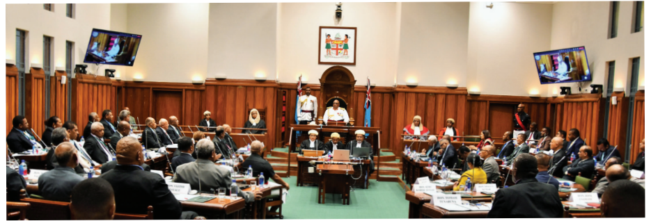
President of the Republic of Fiji, H.E. Ratu Wiliame Katonivere addressing the Members of Parliament.

The people are suffering due to regular power and water cuts. Government will put into place necessary measures to address these long-standing challenges. Government will re-establish the Tripartite Forum, comprising Government, employers and trade unions. It will play a pivotal role in issues relating to employment, productivity and industrial relations. The reinstatement of tripartite