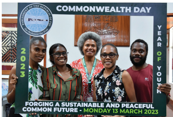
Vanuatu USP students with the Deputy Speaker Hon. Lenora Qereqeretabua.