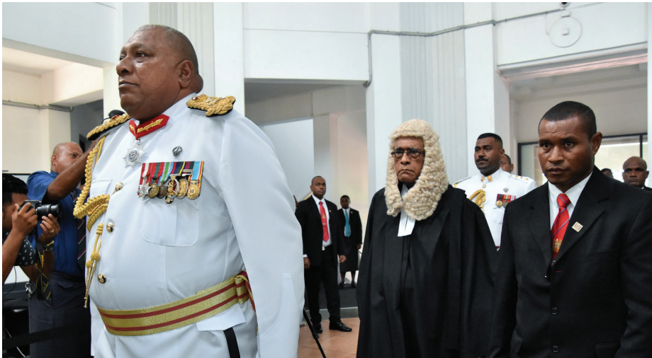
President of the Republic of Fiji, H.E Ratu Willame Katonivere makes his way into the Parliament Chamber followed by the Speaker of Parliament, Hon. Ratu Naiqama Lalabalavu.

The Councillors are a vital link in gathering data and deploying assistance to our rural communities.