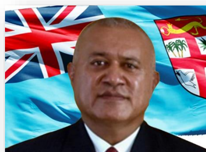
Hon. Ioane Naivalurua