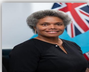
Hon. Lenora Qereqeretabua

Chairperson of the Standing Committee on Foreign Affairs and Defence