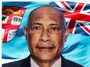
Hon. Viliame Naupoto

Pursuant to Standing Order 109 (2) (e) the Standing Committee on Foreign Affairs and Defence is mandated to look into matters related to Fiji's relations with other countries, development aid, foreign direct investment, oversight of the military and relations with multi-lateral organisations. The members of the Standing Committee on Foreign Affairs and Defence are as follows: