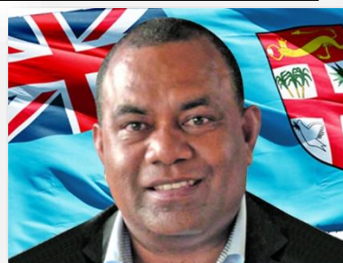
Hon. Jovesa Vocea

Deputy Speaker of Parliament Assistant Minister of Foreign Affairs