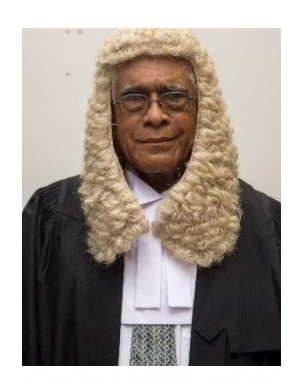
Hon. Ratu Naiqama Lalabalavu Speaker of Parliament (Chairperson)