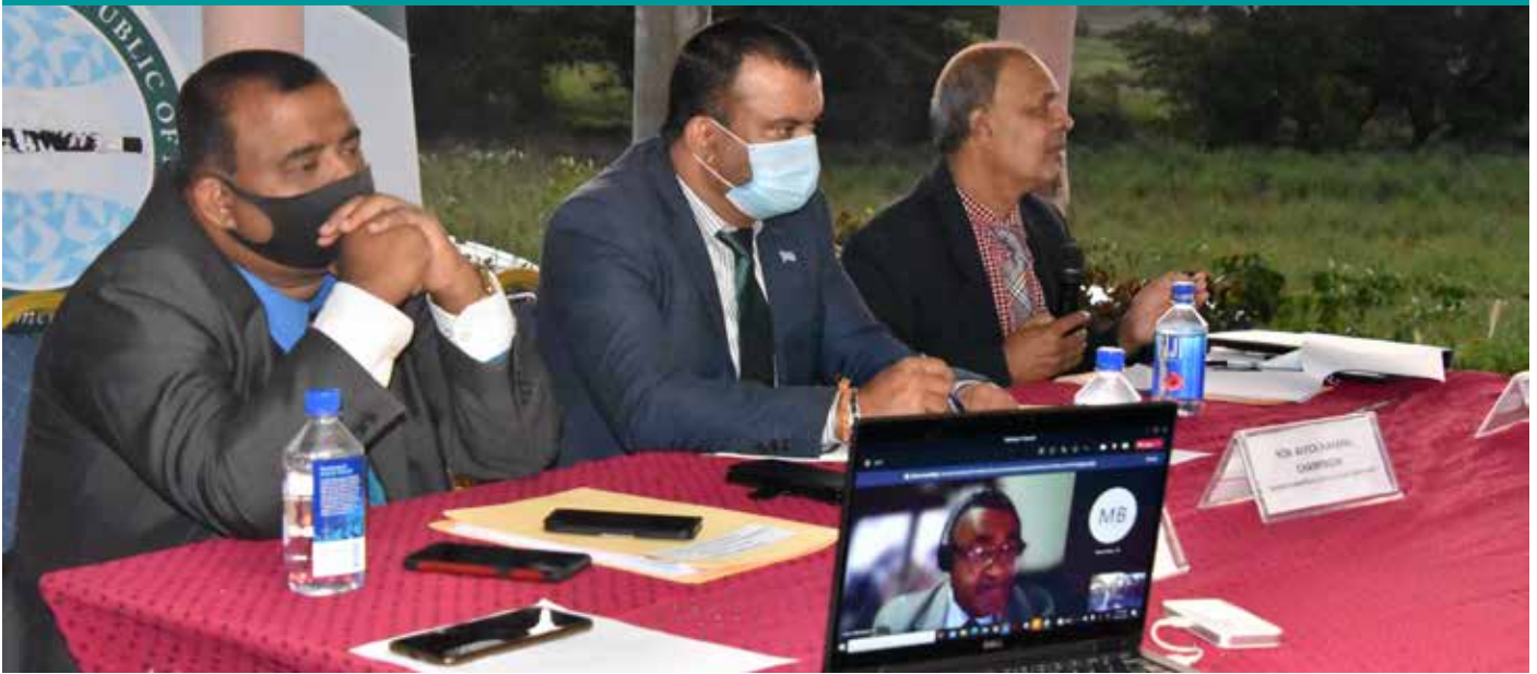
Members of the Standing Committee on Justice, Law and Human Rights during their public consultations in Rakiraki on the Fiji Institute of Accounts Bill in November, 2021.