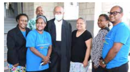
Speaker Hon. Ratu Epeli Nailatikau with some Members of Persons Living with Disabilities at the Parliament foyer in December, 2021.

He acknowledged the support from CPA which has allowed for the hosting of this event and the purchase of the high-end equipment to assist the sign language interpreters during Parliament sittings.