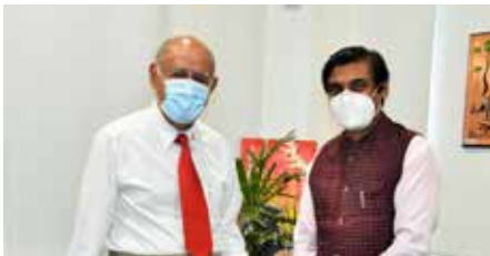
Courtesy call by the new High Commissioner of India to Fiji, H.E. Karthigeyan Subramanyan in August, 2021.