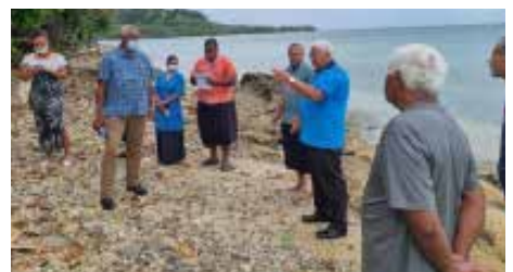
Members of the Standing Committee on Foreign Affairs and Defence during a site visit at the Namatakula Village Seawall in Nadroga in November, 2021.