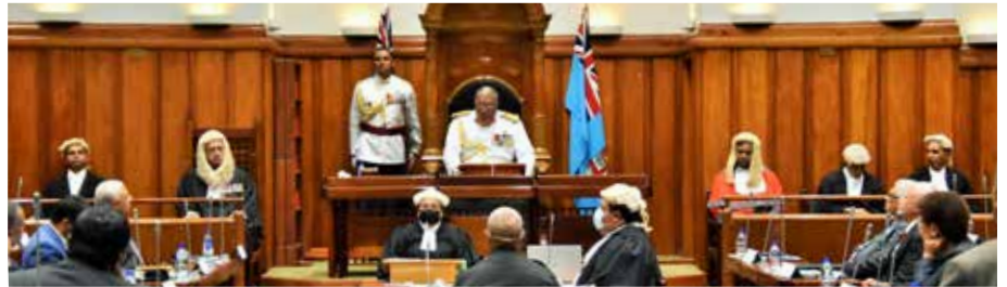
His Excellency the President Ratu Wiliame Katonivere delivering his address during the opening of Parliament on Monday 22nd November, 2021.

An important event in the Parliament calendar took place on Friday, October 22nd, 2021 - the appointment of the new President of Fiji. Turaga na Tui Macuata, Ratu Wiliame Katonivere was nominated by the Prime Minister Hon. Voreqe Bainimarama while the Leader of Opposition nominated Hon. Ro Teimumu Kepa. Having received the votes of more than half of all the Members of Parliament present, the Speaker of Parliament, His Excellency Hon. Ratu Epeli Nailatikau declared Ratu Wiliame Katonivere as the new President of Fiji.