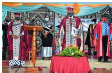
Speaker Hon. Ratu Epeli Nailatikau during the Graduation Ceremony at the University of Fiji in December, 2021.