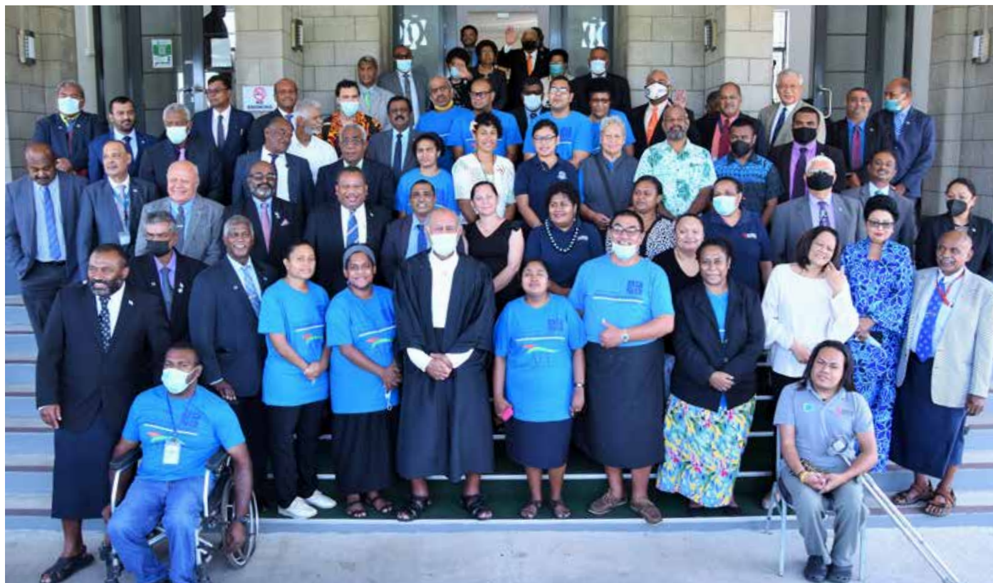
Speaker Hon. Ratu Epeli Nailatikau with some Members of Parliament and the Members of Persons Living with Disabilities at the Parliament foyer in December, 2021

The inaugural Parliament Open Day for Persons Living with Disabilities in Fiji was launched at the Holiday Inn on Friday, December 3rd, 2021.