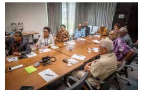
MPs during a breakout session on the Key Development Issues, SDG 16 workshop - Women in Politics and Leadership.

The MPs workshop was facilitated and supported by the UNDP and development partners of the FPSP – the Governments of Australia, New Zealand and Japan.