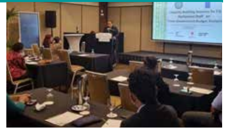
Secretary General to Parliament delivering an opening address at the Budget Systems seminar by UNDP's FPSP.