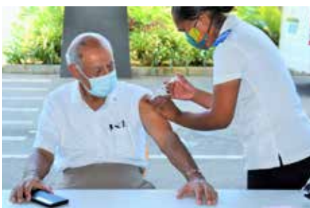
Speaker Hon. Ratu Epeli Nailatikau receiving his booster shot at Albert Park in December, 2021.