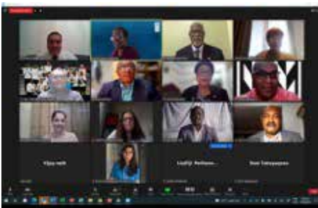
Standing Committee on Economic Affairs and Social Affairs attended a virtual seminar hosted by UNDP Pacific Office in Fiji on Tourism - Global outlook of the sector, priorities and opportunities in August, 2021.