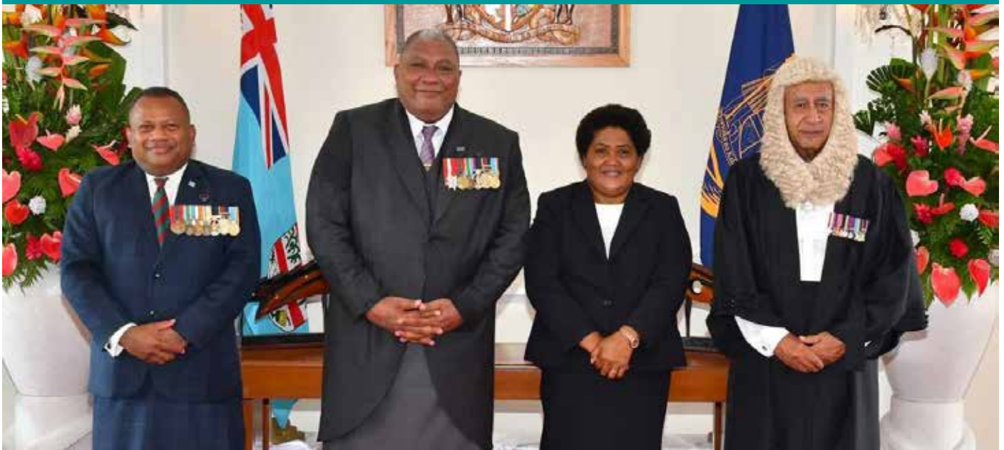
Speaker Hon. Ratu Epeli Nailatikau with the President of Fiji, His Excellency Ratu Wiliame Katonivere, First Lady Mrs Filomena Katonivere and the Minister for Defence and National Security, Hon. Inia Seruiratu after the swearing-in of His Excellency the President at Government House in November, 2021.