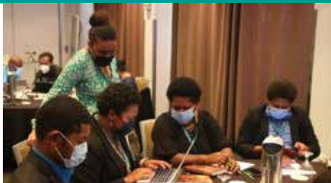
Parliament Staff in discussion at the Corporate Refresher Course at the Holiday Inn Conference room.