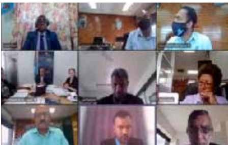
Virtual submission from the Ministry of Waterways and Environment to the Standing Committee on Public Accounts on the Performance Audit Report on the Management of Environment Impact Assessment (PP. No. 273 of 2020) in August, 2021.