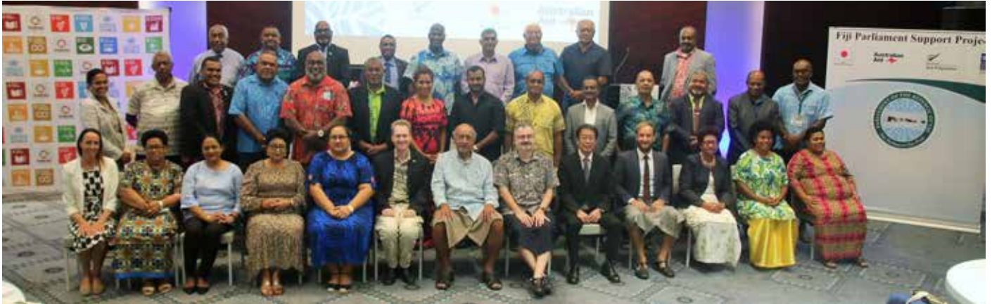
Speaker Hon. Ratu Epeli Nailatikau and Members of Parliament at the Workshop on Key Development Issues.

Speaker Hon. Ratu Epeli Nailatikau has reminded Members of Parliament (MPs) that they need to continuously arm themselves with new information, new knowledge and new ideas.