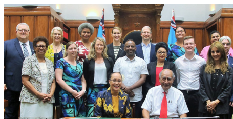
Group photo of the Speaker of Parliament, H.E. Hon. Ratu Epeli Nailatikau with the New Zealand Parliament's Foreign Affairs, Defence and Trade Select Committee in August, 2022.