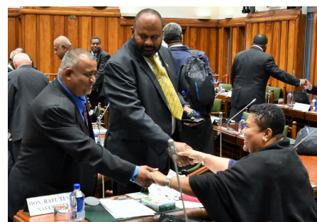
Members of Parliament after the sitting.

The 2022 General Election is expected to be held before the end of this year.