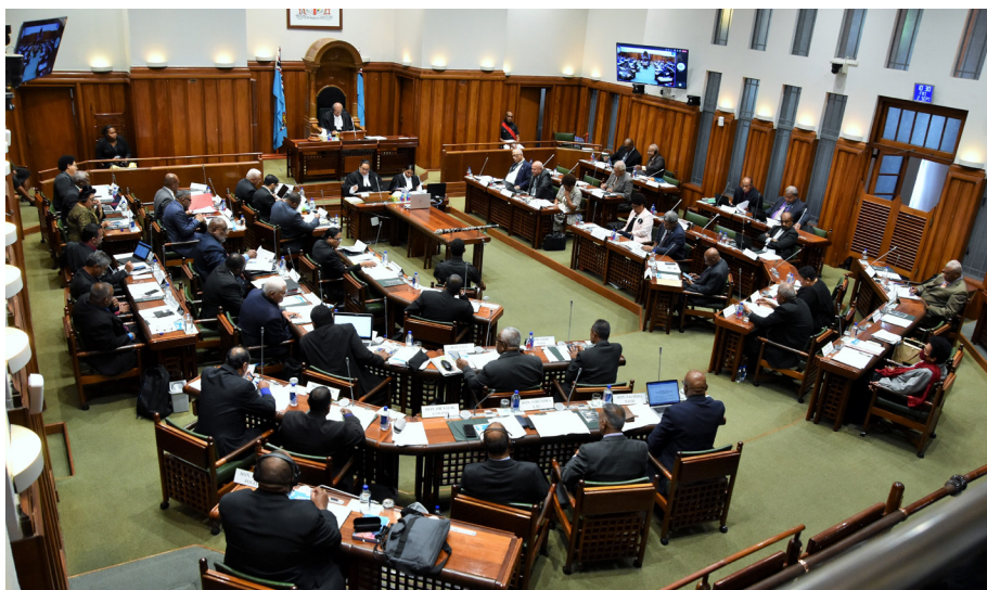
Speaker H.E. Hon. Ratu Epeli Nailatikau addressing Members of Parliament during the September Parliament sitting.

During the last sitting of Parliament on September 2, 2022, the Honourable Speaker of Parliament, His Excellency Ratu Epeli Nailatikau thanked all the Members for their contributions during the final session. The Leader of the Government in Parliament, Hon. Inia Seruiratu moved the motion to adjourn sine die , which was unanimously agreed to.