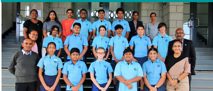
Lil Champ International.