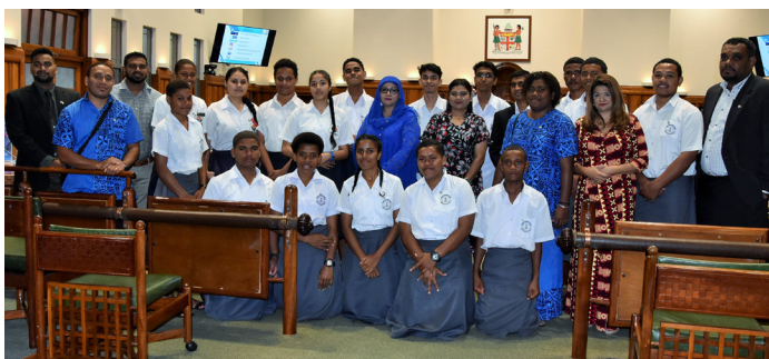
Constitution Day school winners Duavata Secondary School, Votualevu College, Lautoka Central College.