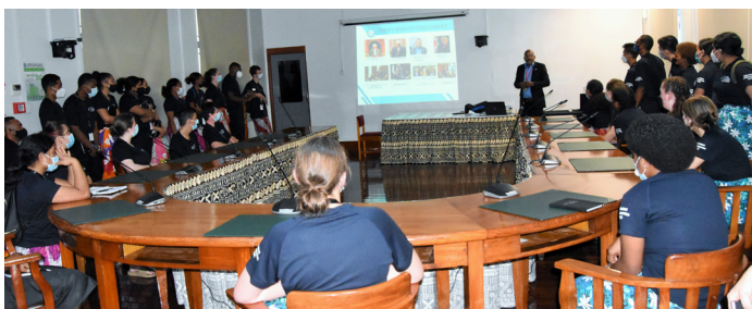
Future Leaders Academy.