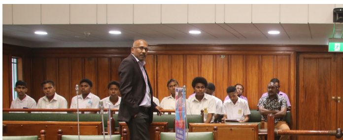
Lomawai Secondary School.