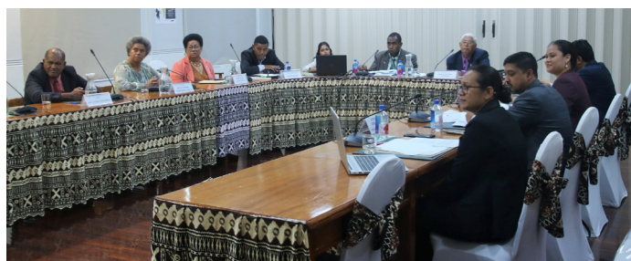
Standing Committee on Foreign Affairs and Defence with the Ministry of Communications during the submission on the Convention on Cybercrime in September, 2022.