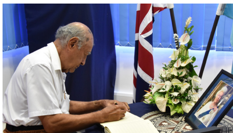
Speaker of Parliament, H.E. Hon. Ratu Epeli Nailatikau signed the condolence book for the late Her Majesty, Queen Elizabeth II, at the British High Commission in September, 2022.