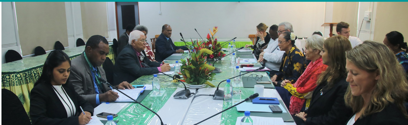
Standing Committee on Foreign Affairs and Defence met and discussed bilateral relations with the New Zealand Parliament's Foreign Affairs, Defence and Trade Select Committee in August, 2022.