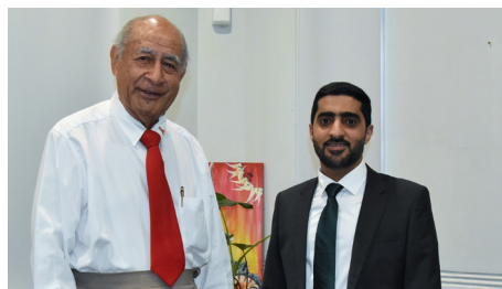
The Non-Resident Ambassador of United Arab Emirates to Fiji H.E Mr Rashed Marta Alsiri Algemzi paid a courtesy visit to the Speaker of Parliament, H.E Hon. Ratu Epeli Nailatikau in September, 2022.