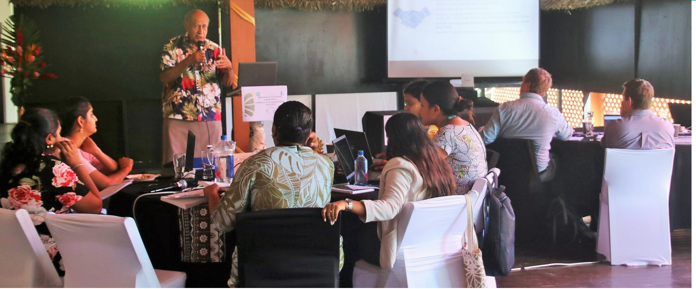
Speaker H.E. Hon. Ratu Epeli Nailatikau during the workshop for the Civil Society Organisation on the 2022-2023 National Budget.

The Fijian Parliament, in conjunction with the United Nations Development Programme Fiji Parliament Support Project ( 'UNDP FPSP' ), hosted a Budget Briefing Workshop for the Civil Society Organisations ( 'CSOs' ) at the Fiji Museum on Friday, 22 July 2022.