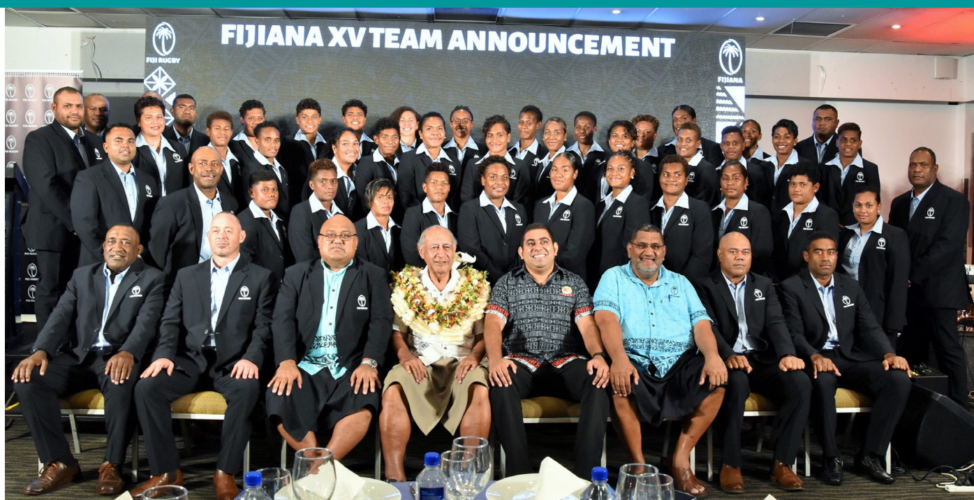
Speaker of Parliament H.E Hon. Ratu Epeli Nailatikau with the Fijiana Rugby Squad at the Grand Pacific Hotel in September, 2022.