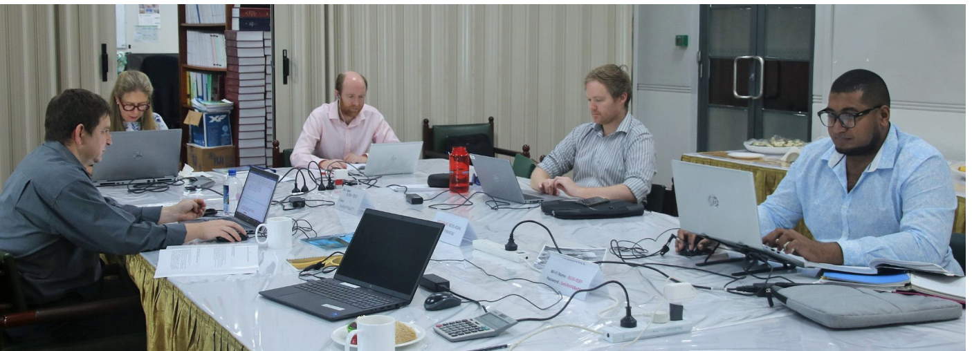
Staff from the Parliaments of Victoria, Tonga and Australia analysing the 2022-2023 budget before the debate by the Members of Parliament. The Pacific Floating Budget project was supported by the UNDP Pacific Office.