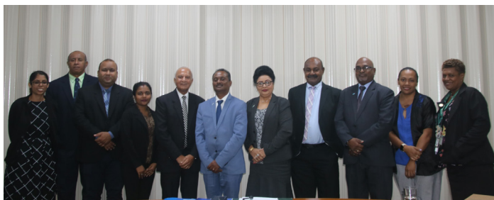
Standing Committee on Economic Affairs with the Pacific Fishing Company (PAFCO) after submission on their 2018 Annual Report in August, 2022.