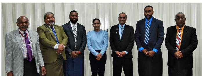
Standing Committee on Natural Resources with the Ministry of Waterways after submission on their 2017-2018 Annual Report in September, 2022.