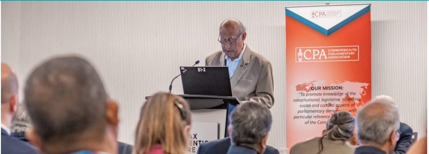
Speaker H.E. Hon. Ratu Epeli Nailatikau presents at the workshop on the Role of Parliaments in Achieving Sustainable Development in Canada in August, 2022.

The Honourable Speaker of the Fijian Parliament, His Excellency Ratu Epeli Nailatikau has stressed that Parliaments play a crucial role in the implementation of the Sustainable Development Goals ('SDGs').