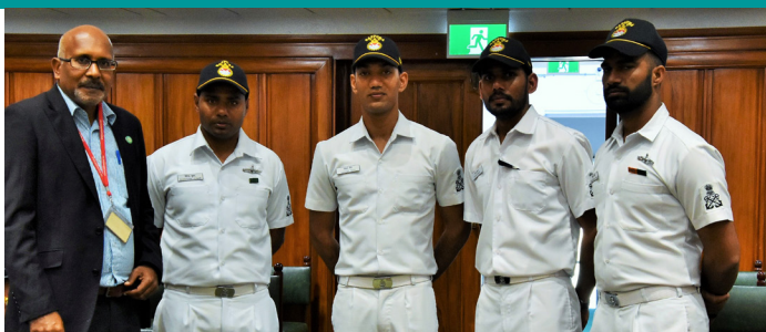
Indian Navy officers.