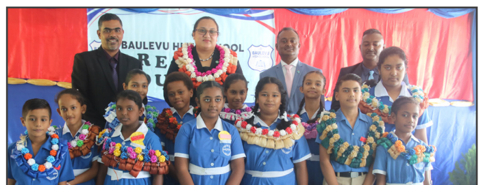
With the Koroqaqa Primary School senior prefects.