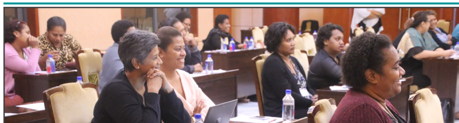
Suva participants listened attentively during the Commonwealth Women Parliamentarians (CWP) Fiji Group Mentoring Workshop for Aspiring Women Politicians at Suva Civic Centre in May, 2022.

A total of one hundred and ninety two (192) women around Fiji were empowered during a pioneer Commonwealth Women Parliamentarians ('CWP') Fiji Group Mentoring Workshop for Aspiring Women Politicians held virtually in Suva, Nadi and Labasa on May 18th, 2022.