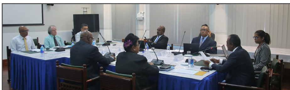
Submission to the Standing Committee on Economic Affairs with the Fiji Brokers Board during submission on their 2015–2017 Annual Report on June 7, 2022.