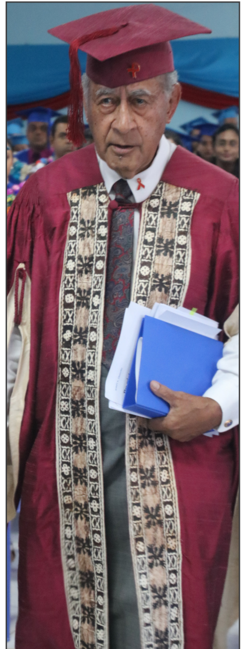
Speaker of Parliament and Chancellor of the University of Fiji, H.E. Hon. Ratu Epeli Nailatikau during the 2022 University of Fiji Graduation.

A total of four hundred and four (404) students graduated from various programmes.