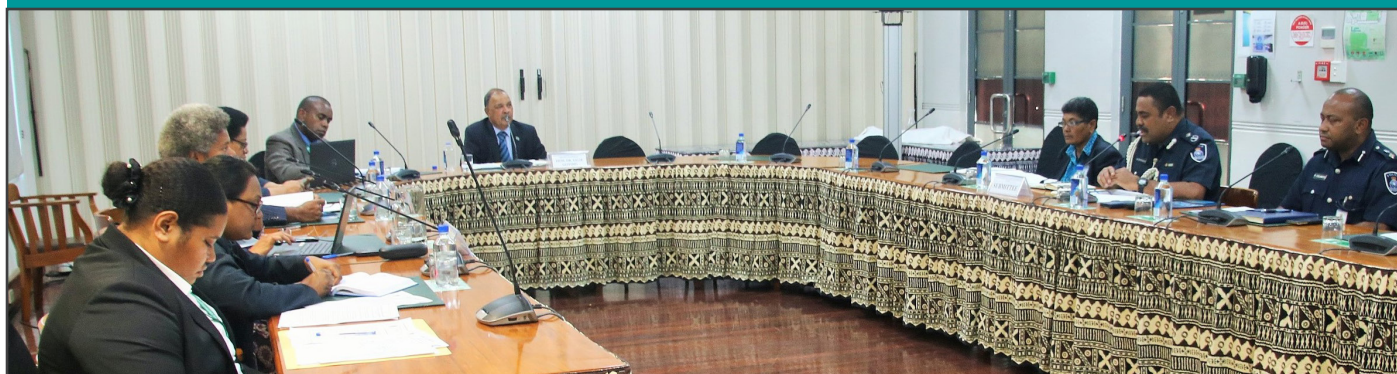
Submission to the Standing Committee on Foreign Affairs and Defence from the Fiji Police Force on their August 2018–July 2019 Annual Report on June 14, 2022.