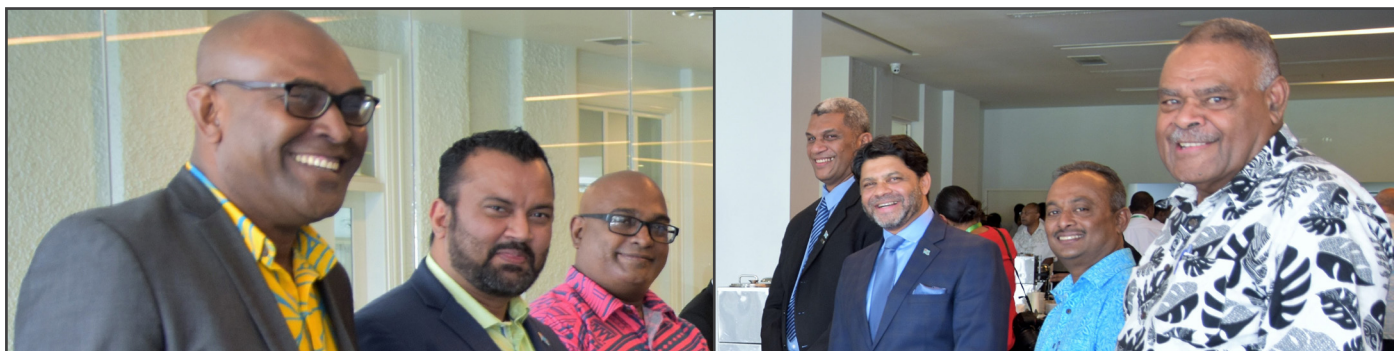
The Attorney-General and Minister for Economy, Civil Service, Communications, Housing and Community Development, Hon. Aiyaz Sayed-Khaiyum (third from right) shares a light moment with some Members of Parliament during the official visit of the Governor-General of Australia, H.E David Hurley in April 2022.