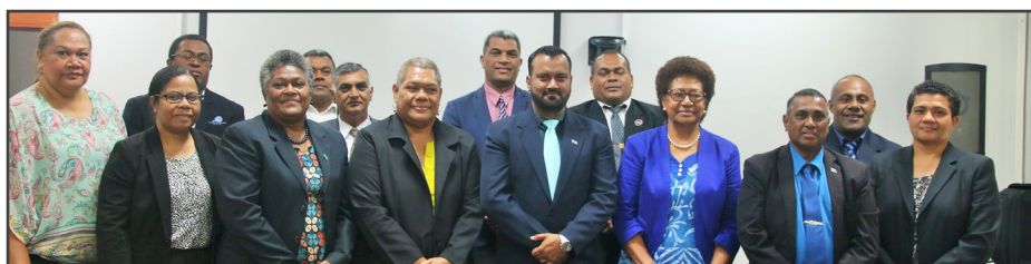
Standing Committee on Public Accounts with Ministry of Lands and Mineral Resources after submission on the Compliance Audit Report Relating to COVID-19 Response on June 8, 2022.