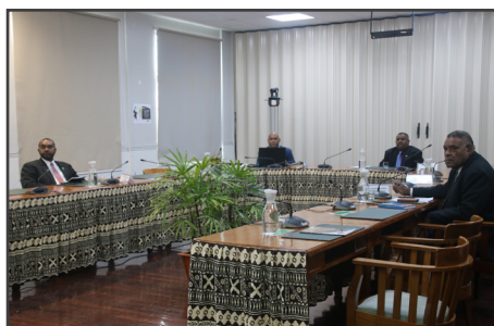
Standing Committee on Justice, Law and Human Rights during one of their deliberations.