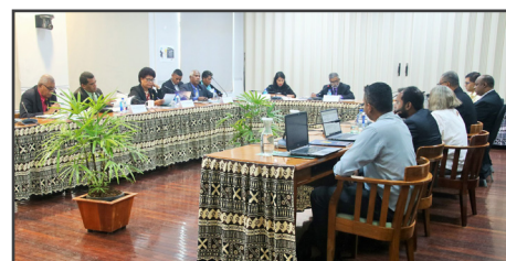
Submission to the Standing Committee on Social Affairs from the Fiji National University on their 2020 Annual Report on June 16, 2022.