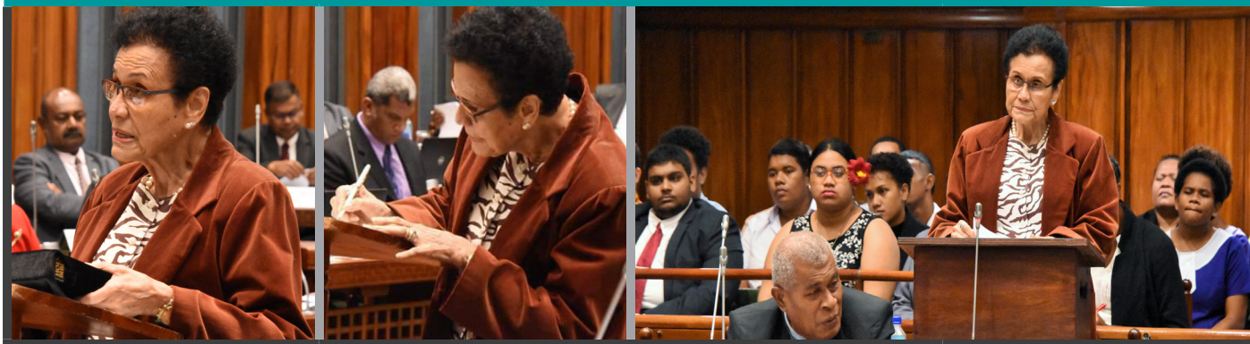
Swearing in and maiden speech by the new Member of Parliament, Hon. Mere Naulumatau.