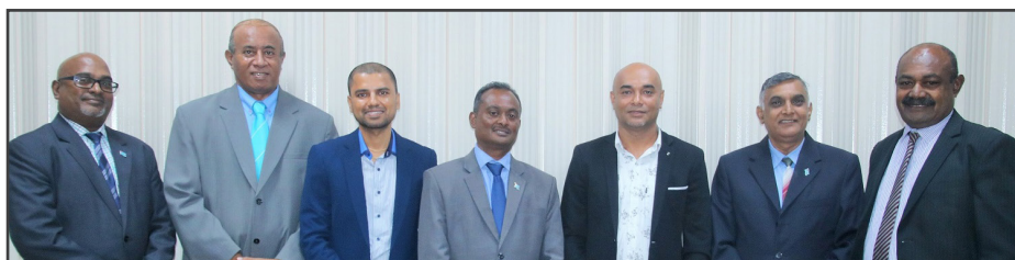
Standing Committee on Economic Affairs with the Fiji Meat Industry Board after submission on their 2015–2017 Annual Report on June 7, 2022.