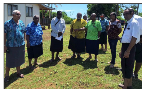
Standing Committee on Natural Resources on site visitation during their tour to the North on April 11, 2022.