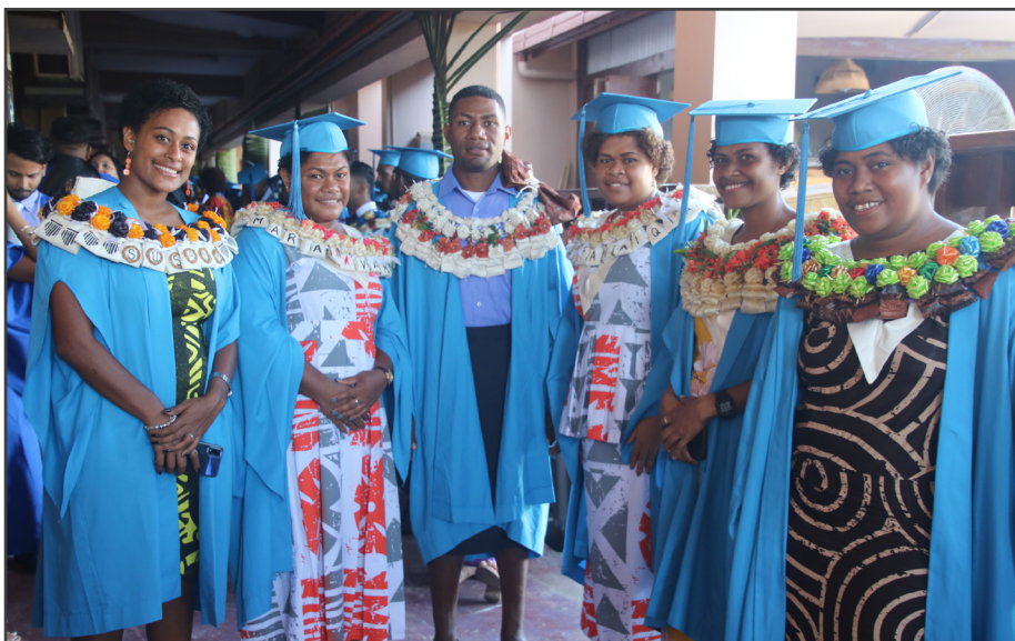
Graduates during the 2022 University of Fiji Graduation at Saweni Campus.