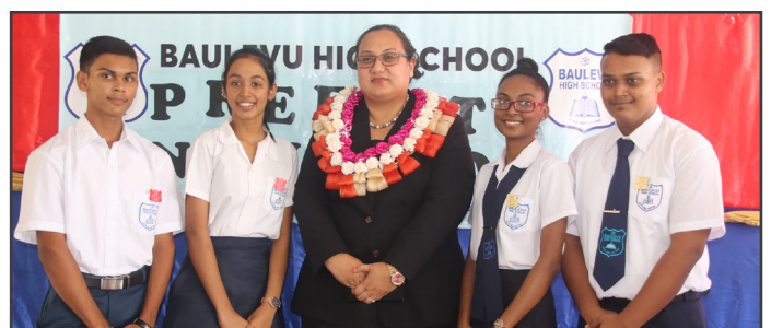
With the Baulevu High School Senior prefects after their induction.