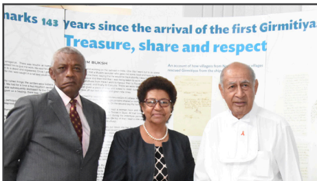
Speaker of Parliament, H.E. Hon. Ratu Epeli Nailatikau with Hon. Ro Teimumu Kepa and Hon. Pio Tikoduadua in front of the display at the Parliament Foyer in commemoration of the 143rd anniversary of the arrival of the Girmityas.