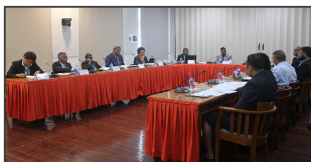
Submission to the Standing Committee on Public Accounts from the Reserve Bank of Fiji on the Audit Report on Compliance Audits Relating to COVID-19 Responses on May 4, 2022.