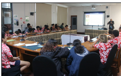
A group of students from The Learning Centre toured the Parliament in June, 2022.