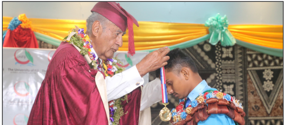
Speaker of Parliament and Chancellor of the University of Fiji, H.E. Hon. Ratu Epeli Nailatikau awarding a graduate with his medal.

“I encourage families living in the Western Division to take full advantage of UniFiji’s presence and the opportunity for higher