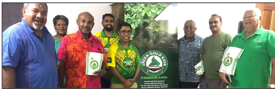
Standing Committee on Natural Resources visited the Green Gold Kava at Savusavu during their tour to the North.