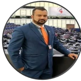
Hon. Alvick A. Maharaj (Chairperson)