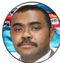
Hon. Mosese Bulitavu (Member)