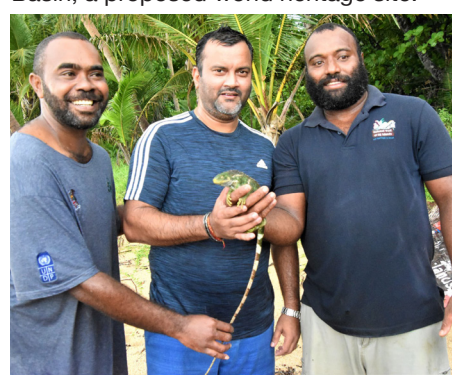
Members of the Standing Committee on Justice, Law and Human Rights at Yaduataba Island, the sanctuary of Fii's crested in Jana

In Naitasiri, public consultation was held with the villagers of Nadakuni as they partly have the landowning rights for Sovi Basin, a proposed world heritage site.