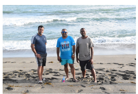
Members of the Standing Committee on Justice, Law and Human Rights, at the Sigatoka Sand dunes during the Heritage Bill consultation.