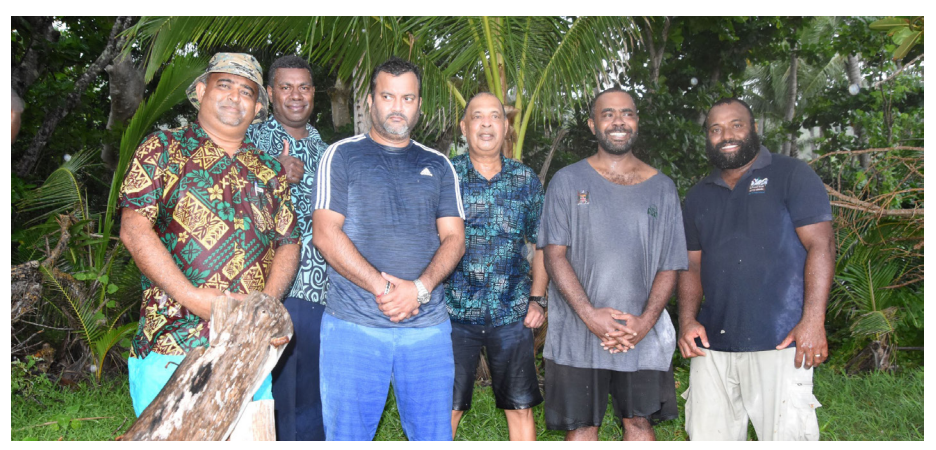
Members of the Standing Committee on Justice, Law and Human Rights at Yaduataba Island, the sanctuary of Fiji's crested iguana.

"This is the first time we are having this meeting in Dagau, Seaqaqa and it has been an educational programme for us all. Once both Bills are passed, the people of Vanua Levu will greatly benefit as tourists will be