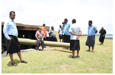
Members of the Standing Committee on Justice, Law and Human Rights at the Momi Bay Battery Historical Park during the Heritage Bill consultation.