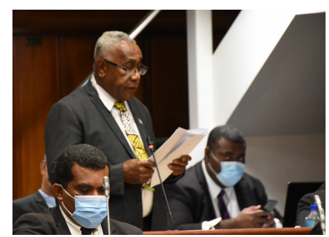
Deputy Chairperson of the Standing Committee on Natural Resources, the Hon. Jale Sigarara presents a Committee Report during Parliament sitting in February,