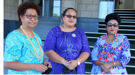
with Hon. Ro Teimumu Kepa and Hon. Veena Bhatnagar during the International Women's Day celebration, March