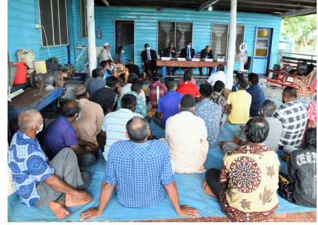
Public Consultation by the Standing Committee on Justice, Law and Human Rights at Seagaga on the Heritage Bill in February, 2022.