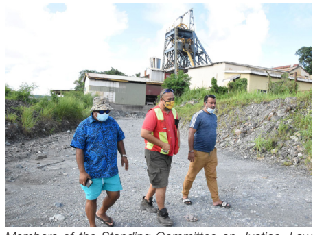
Members of the Standing Committee on Justice, Law and Human Rights, at Vatukoula Gold Mine during the Heritage Bill consultation.