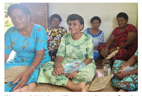
Women of Nabaitavo Village attending the Standing Committee on Justice, Law and Human Rights consultation on the Heritage Bill in March, 2022.