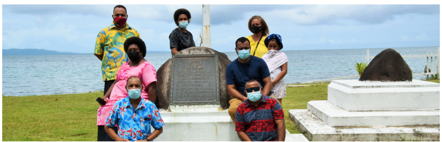
Members of the Standing Committee on Justice, Law and Human Rights with members of the public at the Deed of Cession site in Levuka as part of their site visit and public consultation on the Heritage Bill.

he Standing Committee on Justice, Law and Human Rights ('Standing Committee') conducted public consultations around the country on the Heritage Bill 2021 (Bill No. 3 of 2021) and the Investment Fiji Bill 2022 (Bill No. 5 of 2022).