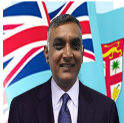
Hon. Virendra Lal (Government MP)