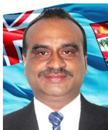
Hon. Sanjay Kirpal Chairperson

The substantive members of the Standing Committee on Natural Resources are as follows: