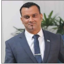
Hon. Alvick A. Maharaj (Chairperson)