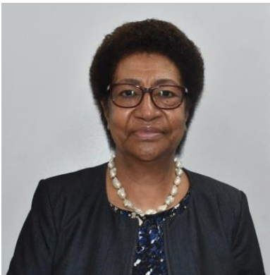
Hon. Ro Teimumu Kepa (Opposition MP)