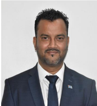
Hon. Alvick Avhikrit Maharaj (Chairperson MP)

The substantive Members of the Standing Committee Public Accounts Committee are as follows: