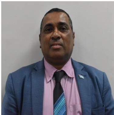
Hon. Joseph Nitya Nand (Deputy Chairperson MP)