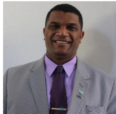
Hon. Aseri Masivou Radrodro (Opposition MP)