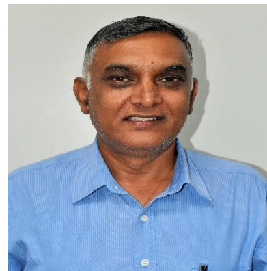
Hon. Virendra Lal (Government MP)