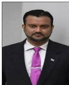
Hon. Alvick A. Maharaj (Chairperson)