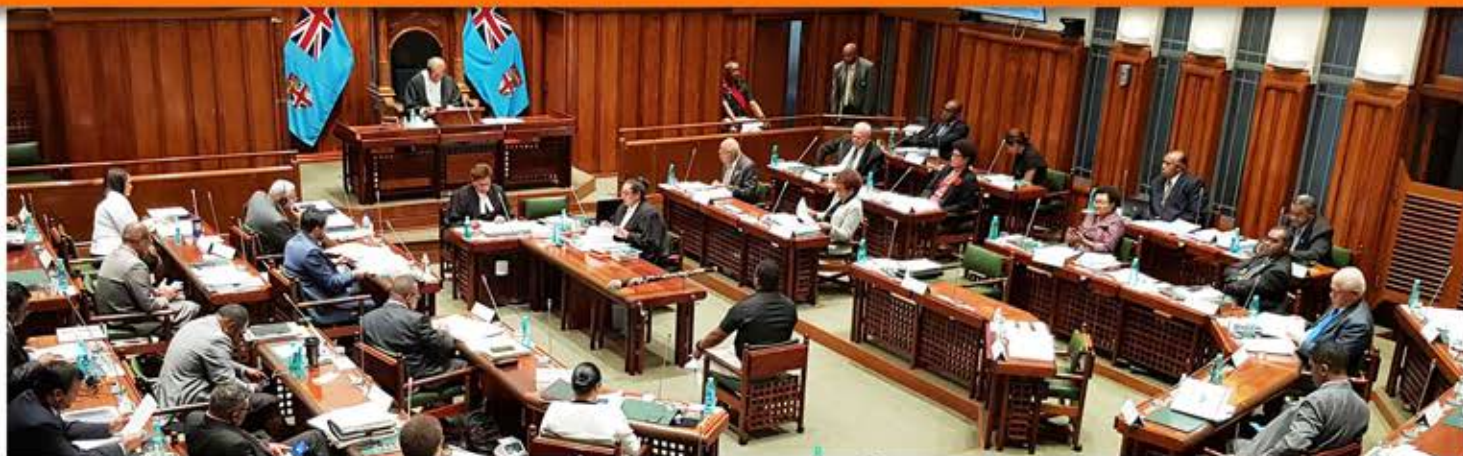
Members of Parliament practise social distancing during Parliament sitting in September, 2020.

During the COVID-19 global health emergency, Parliaments have a vital role to play in supporting national efforts to stem the pandemic and in mobilizing the resources to implement the health measures recommended by the World Health Organization (WHO). They are also key in legislating to mitigate the effects of the ensuing economic crisis and protecting the livelihoods of the populations that they represent.