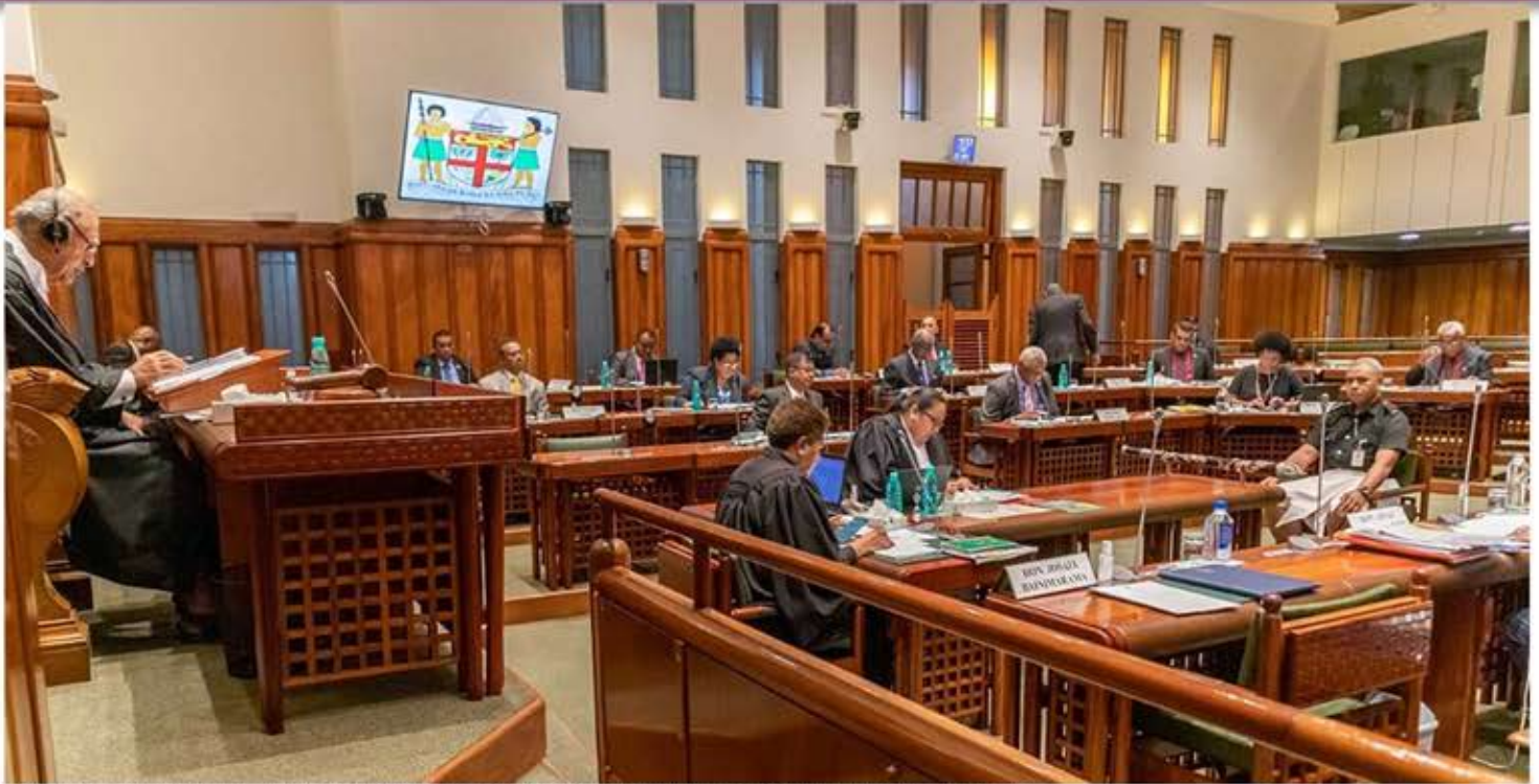
National Federation Party Members occupying three front seats on the Opposition side of the House, with the Government Members behind them.

"Honourable Members, as you may be aware the Registrar of Political Parties has issued a Notice pursuant to section 19 of the Political Parties (Registration, Conduct, Funding and Disclosures) Act 2013. The Notice clearly states that the Social Democratic Liberal Party (SODELPA) is suspended with immediate effect on 26 May 2020 for a period of 60 days.