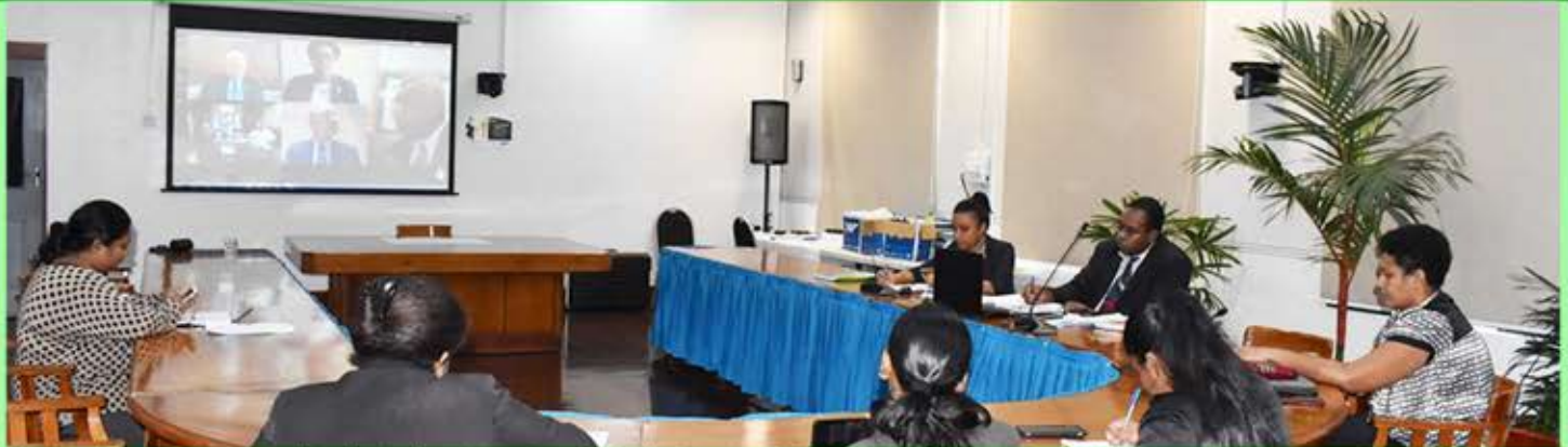
Members of the media and secretariat during the virtual committee meeting of the Standing Committee on Foreign Affairs and Defence in June, 2020.

VIRTUAL COMMITTEE MEETINGS BECAME THE NEW NORMAL SINCE THE COVID-19 PANDEMIC