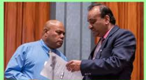
Government MP Hon. Sanjay Kirpal clarifying an item in the Order Paper with Chamber Orderly Kitione Bete.