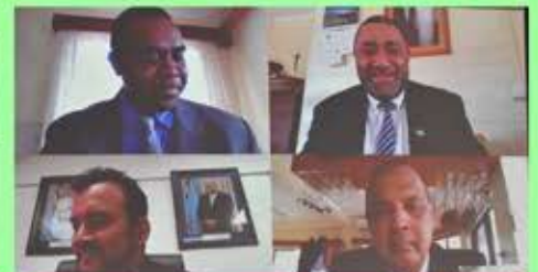
Virtual committee meeting of the Standing Committee on Justice, Law and Human Rights in May 2020. Top (L-R) Hon. Mosese Bulitavu and Hon. Ratu Sukumo Matanitobua. Bottom (L-R) Chairperson Hon. Abvick Maharaj and Hon. Dr. Salik Govind.