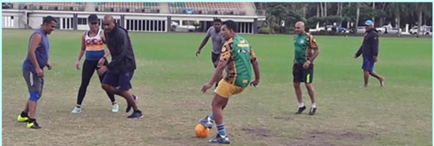
Staff enjoying a game of soccer.