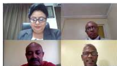
Virtual meeting of the Standing Committee on Economic Affairs in May, 2020.

The Standing Committee on Foreign Affairs and Defence received virtual submissions on the Madrid Agreement Concerning the International Registration of Marks 1981 (Madrid Agree-