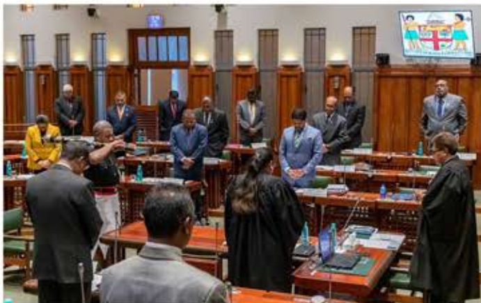
Prayer time at the beginning of the Parliament sitting in May, 2020.