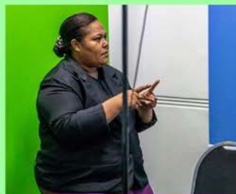
Sign language is an important feature during Parliament sitting. Staff from the Fiji Association of the Deaf during the live Parliament session in May, 2020.