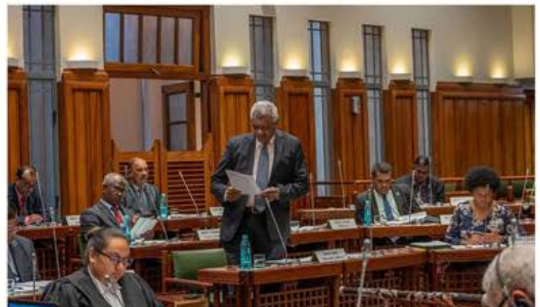
Opposition MP Hon. Pio Tikoduadua during debates in May, 2020.