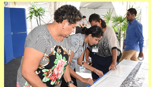
Parliament staff busy preparing for the 2018-2019 National Budget Announcement on June 28, this year.