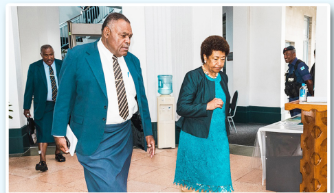
Opposition Member of Parliament Hon. Mikaele Leawere and Leader of the Opposition Hon. Ro Teimumu Kepa making their way to Parliament in May, this year.