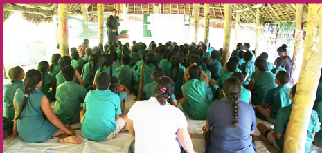
Students and teachers of Malahaha Primary School in Rotuma listening during the 'Parliament Bus' programme in their May this year.