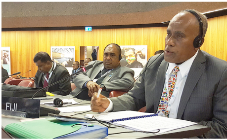
Minister for Youth and Sports Hon. Laisenia Tuitubou (close to camera) speaking at the Youth forum during the 138th IPU Assembly in Geneva, Switzerland in March, this year.