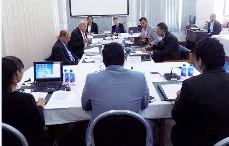
Members of the Standing Committee on Economic Affairs hearing submissions from the Fijian Competition & Consumer Commission in January, this year.