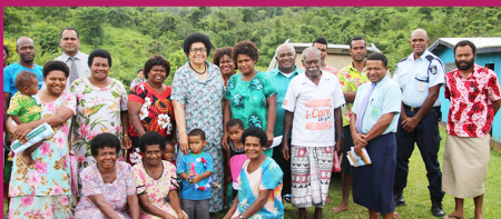
Speaker Hon. Dr. Jiko Luveni with villagers of Nasiriti in Naitasiri during the 'Meet the Speaker' programme in February, this year.