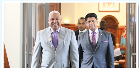
Prime Minister Hon. Voreqe Bainimarama and Attorney-General Aiyaz Sayed-Khaiyum making their way out of Parliament during this year's March Parliament sitting.