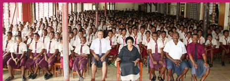
Students and teachers of Tailevu North College with the Speaker Hon. Dr. Jiko Luveni after the 'Meet the Speaker' outreach programme in February, this year.