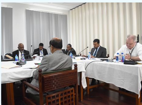
Deliberations on the Online Safety Bill by the Members of the Standing Committee on Justice, Law and Human Right in May, this year.