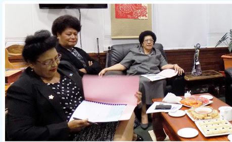
Speaker Hon. Dr Jiko Luveni with some women Members of Parliament during a special meeting in January, this year.