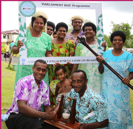
Villagers of Nabukaluka in Naitasiri during a community outreach programme in their village in January, this year.

The Fijian Parliament, through the Civic Education and Media Unit, continues to reach out to the communities, schools and villages to educate the people about Parliament. The outreach initiatives is aimed at informing the people about the roles and functions of Parliament, its works and how Fijians can engage with Parliament. Schools, community groups and individuals have been visiting Parliament to learn more.