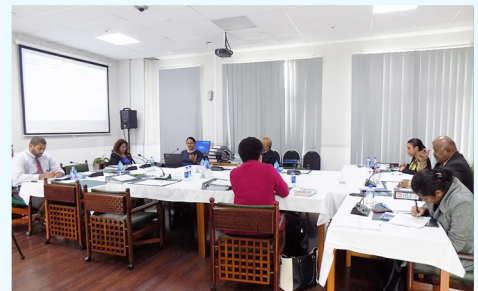
Members of the Standing Committee on Social Affairs hearing submissions from the Consumer Council of Fiji in May, this year.