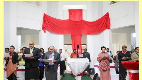
Some Members of Parliament with staff participating at the Easter Service in March, this year.