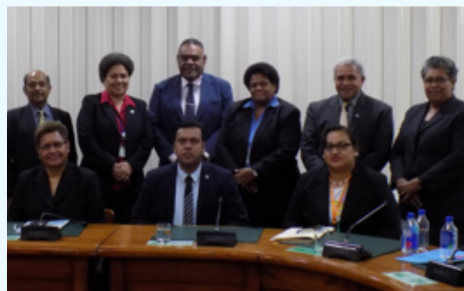
Group photo – Members of the Standing Committee on Justice, Law and Human Rights with the senior executives of the Department of Legislature.