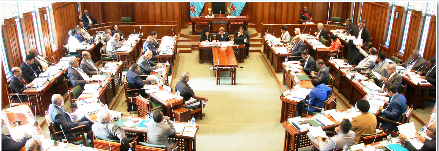
Committee-of-the-Whole Parliament during the March Parliament sitting.