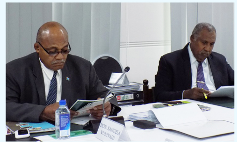
Standing Committee on Natural Resources deliberations, Hon. Samuela Vunivalu (left) and Hon. Jiosefa Dulakiverata (right).