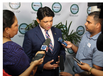
Attorney-General and Minister for Economy, Public Enterprises, Civil Service and Communications Hon. Aiyaz Sayed-Khaiyum being interviewed by the media after the 2018-2019 Budget announcement.

the public, as partakers in decision-making, have access to proceedings when Standing Committee meetings are in session."