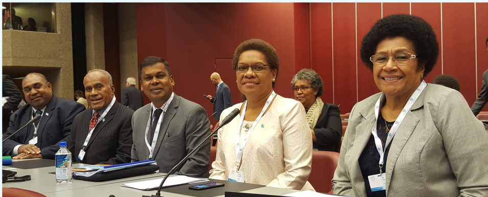
Fiji delegation at the 138th IPU Assembly in Geneva – Speaker, Hon. Dr Jiko Luveni, Minister for Women, Children and Poverty Alleviation, Hon. Mereseini Vuniwaqa, Opposition MP Hon. Prof. Biman Prasad, Minister for Youth and Sports, Hon. Laisenia Tuitubou and the Assistant Minister for Rural & Maritime Development, Disaster Management and Meteorological Services Hon. Joeli Cawaki.

Strengthening the parliamentary contribution to the global compact for migration, sustaining peace as a vehicle for achieving sustainable development and tackling women's under-representation in politics were the topics of discussions at the 138th Assembly of the Inter-Parliamentary Union (IPU) from 24-28 March, 2018 in Geneva, Switzerland.