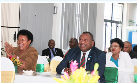
Government Member of Parliament Hon. Jilila Kumar and Minister for Agriculture, Rural & Maritime Development, Disaster Management and Meteorological Services Hon. Inia Seruiratu sharing a light moment during one of the lunch breaks in the March sitting, this year.