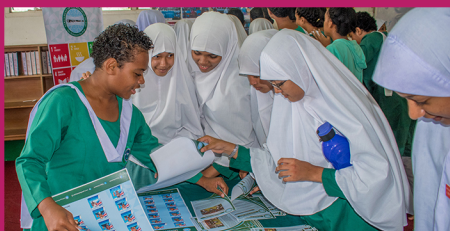
Students of Nasinu Muslim College collecting Parliament factsheets during the 'Parliament Bus' programme in their school in February, this year.