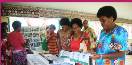
Villagers of Wema in Nadroga-Navosa collecting Parliament factsheets during the 'Parliament Bus' programme in the village in April, this year.