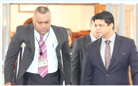
Attorney-General and Minister for Economy, Public Enterprises, Civil Service and Communications, Hon. Aiyaz Sayed-Khaiyum with Assistant Minister for Youth and Sports Hon. Iliesa Delana making their way out of Parliament during the May sitting, this year.