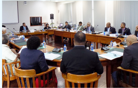
Members of the Standing Committee on Public Accounts hearing submissions in January from the Water Authority of Fiji.