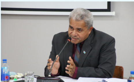
Deputy Chairperson of the Standing Committee on Justice, Law and Human Rights Hon. Mataiasi Niumataivalu during a Fiji Women's Rights Movement submission in April, this year.