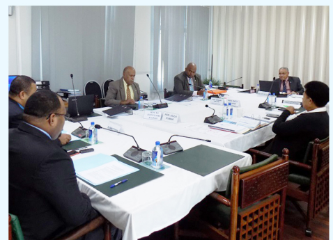
Members of the Standing Committee on Foreign Affairs and Defence hearing submissions in June from Ministry of Foreign Affairs officials.