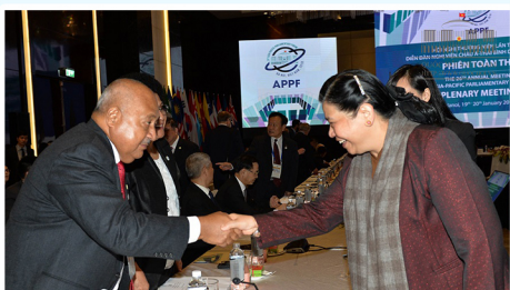
Minister for Defence and National Security, Hon. Ratu Inoke Kubuabola meeting Vice President of the National Assembly of Vietnam, H.E. Madam Tong Thi Phon at the first plenary session of APPF26 in January.