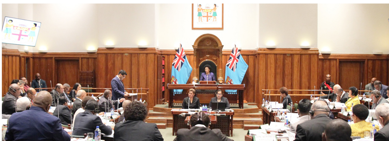
Attorney-General and Minister for Economy, Public Enterprises, Civil Service and Communications Hon. Aiyaz Sayed-Khaiyum announcing the 2018-2019 National Budget in Parliament on June 28.

Capacity-building for Members of Parliament will be a focus area during the new term of Parliament.