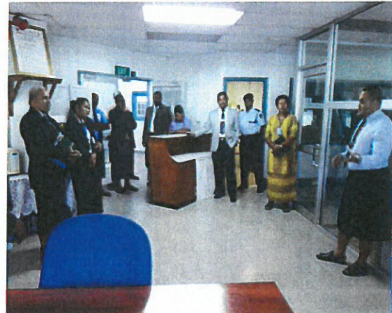
A doctor in the force that helps in crime investigation in terms of post mortem.