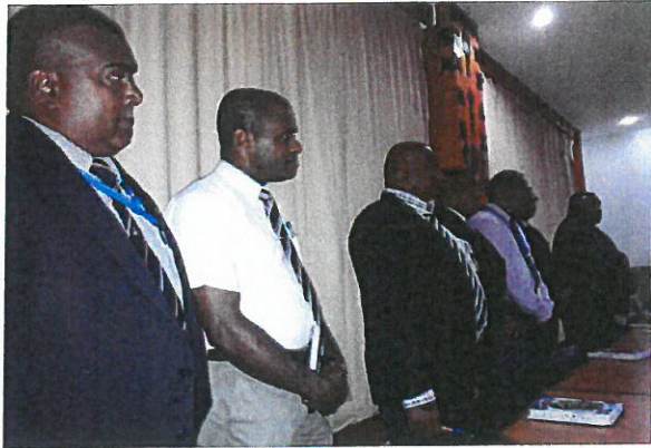
All the Directors at the CID Unit