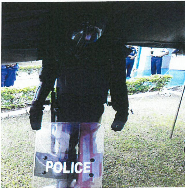
Full fire armour on display to the Committee.