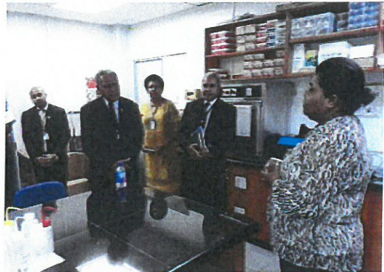
Forensic Science Service Unit: Footprint and Fingerprint dusting, DNA testing for suspected criminal offences.