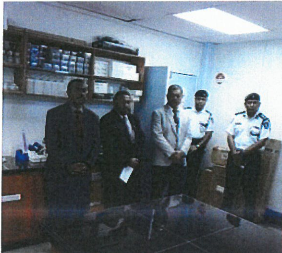
Honourable Members hear more from the Forensic Science Services Unit.