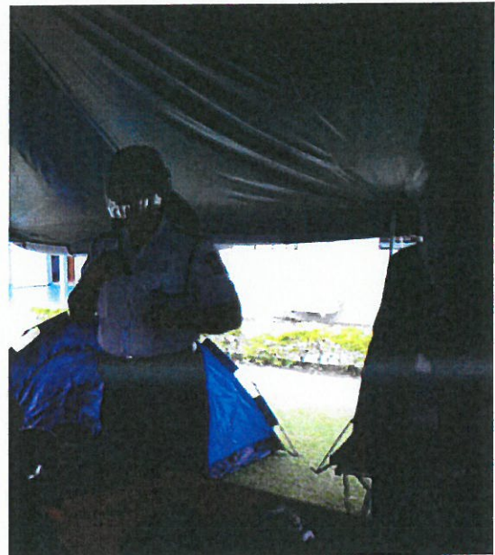
Tent for bush camping, training and site investigation outside Suva.