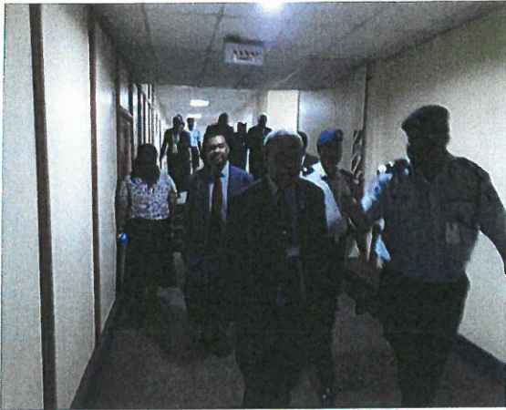
Committee touring the Police HQ at Centrepont.