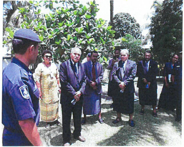
Officer in charge in dog training share more to the Honourable Members on how dog are being trained to actually detect drugs and weapons.