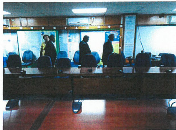
Police HQ Conference Room.