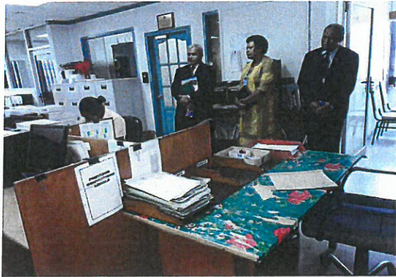
A visit to the Police Clearance Processing Unit