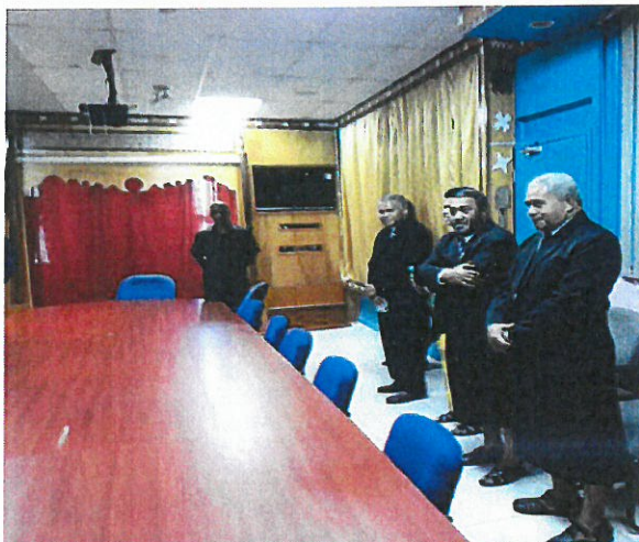
Police Officers at CID Unit welcomed the Hon. Committee Members to their Conference Room