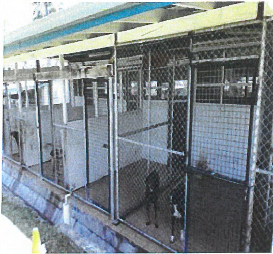
K-9 Unit: Dogs are trained to detect drugs and weapons that are smuggling into the country through our borders.