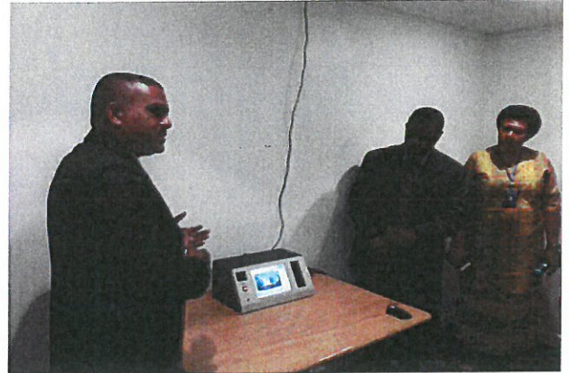
Screen recorded interview room for police crime investigation.