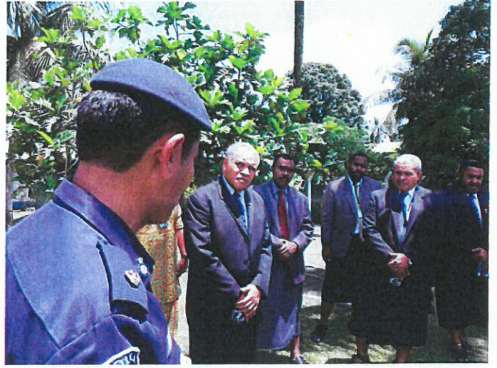
K-9 Officer tells more to the Standing Committee.