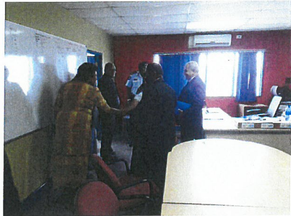
Human Resource Unit at the Police HQ, Centrepont.