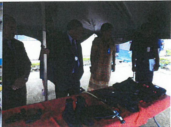
Hon. Members glanced at the equipment that was donated by the Chinese Government such as flippers, reef shoes, oxygen tank and etc.