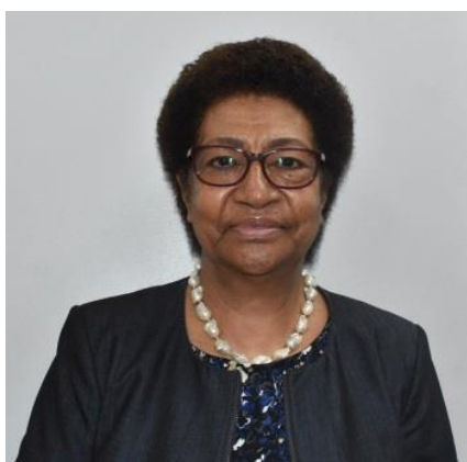
Hon. Ro Teimumu Kepa (Opposition MP)