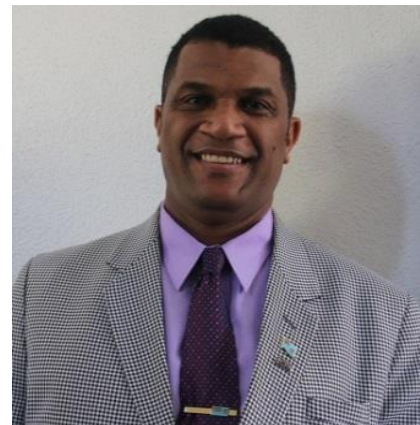
Hon. Aseri Masivou Radrodro (Opposition MP)