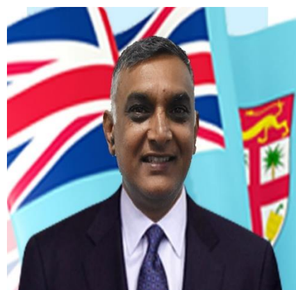
Hon. Virendra Lal (Government MP)