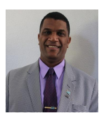
Hon. Aseri Masivou Radrodro (Opposition Member)