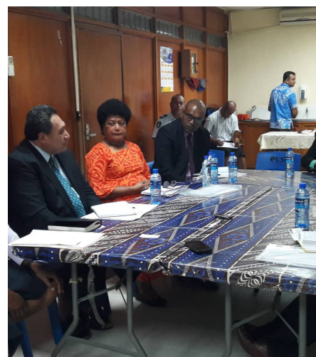
Members of the Standing Committee on Social Affairs during their tour of the Northern Division

In line with the 2030 Agenda's overarching objective of leaving no one behind, Committees should pay particular attention to hearing the concerns of and gathering feedback from the most marginalised and vulnerable groups of society on how SDG implementation is impacting on their lives. Marginalised and vulnerable groups (i.e. women, youth, persons with disabilities, the elderly, LGBTI etc.) are generally lagging behind national averages on measures such as per capita GDP, life expectancy, educational achievement, political participation, and their needs need to be taken into account in the work of Committees if the SDG's are to be fully realised. Conducting field visits allows Committees to bring the voices and perspectives of underrepresented or marginalised groups into parliamentary processes regarding SDG issues. Disaggregated population indicators of the SDGs can guide Committees in terms of which segments of society to focus on and meet with when conducting site visits.