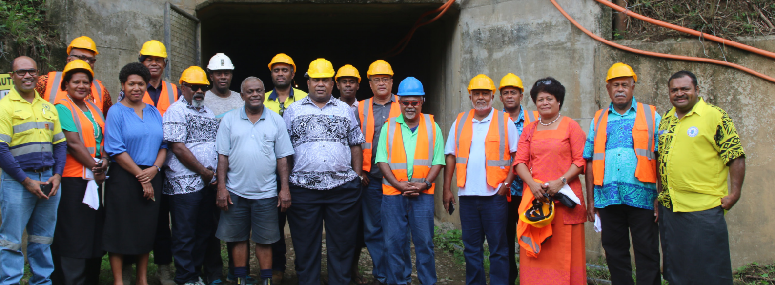
Members of the Natural Resources Committee visit a quarry in Vanua Levu.