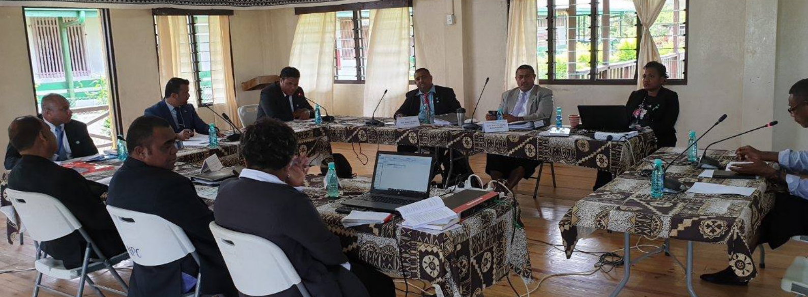
Members of the Standing Committee on Justice, Law and Human Rights during their public consultation tour of the Western Division to hear from members of the public their views and opinions on the Adoption Bill (Bill No. 32 of 2018)