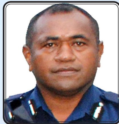
Isikeli Ligairi DEPUTY COMMISSIONER OF POLICE