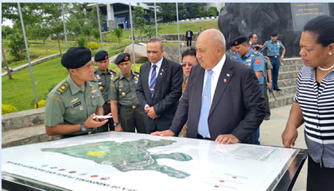
Commissioner of Police & Minister for Defence and National Security visited the Indonesian Peacekeeping Centre Sentul, Bogor on 3rd November, 2016