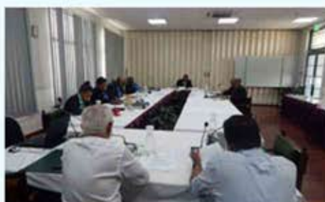
Members of the Standing Committee on Natural Resources receiving submissions from PAFCO in November, 2016.