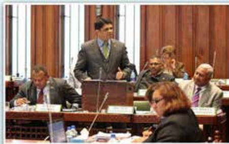
Attorney-General and Minister for Economy, Public Enterprises, Civil Service and Communications Hon. Atiyaz Sayed-Khaiyum interjects during the Parliament Sitting in September, 2016.