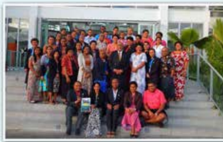
Protocol training for Parliament Staff in July, 2016.