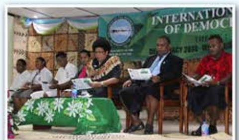
Hon. Dr Jiko Luveni officiated at the International Day of Democracy celebrations in Labasa in September, 2016.