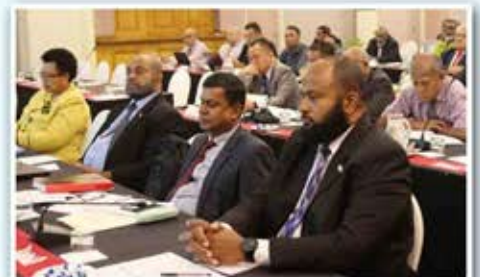
Members of Parliament during the Inter-Parliamentary workshop in Nadi in November, 2016.