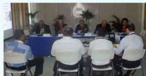
Members of the Standing Committee on Foreign Affairs and Defence receiving submissions from stakeholders in Nadi in November, 2016.