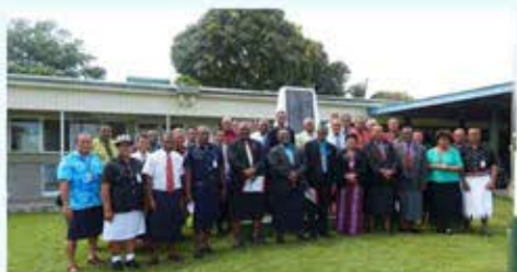
Members of the Standing Committee on Social Affairs on the island of Rotuma during their public consultation on the two Rotuma Bills in December, 2016.