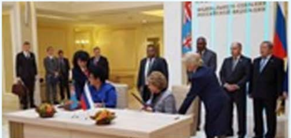
Speaker of Parliament Hon. Dr. Jiko Luveni signing the MOU with her counterpart Mrs. Valentina Matvieko.

Mrs Matvieko, who is the President of the Federation Council, said that the relationship between the two countries was already a dynamic one and the MOU signed was a sound foundation for the new parliamentary partnership.