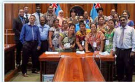
Kiribati and Fiji Head Teachers and education officials during a tour of Parliament in November, 2016.