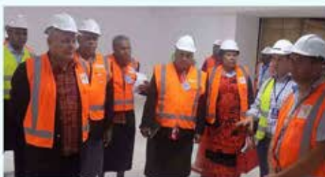
Members of the Standing Committee on Foreign Affairs and Defence during their site visit to the Nadi International Airport in November, 2016.