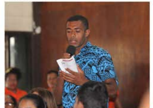
A youth raising a question to the panellists during the 4th Speakers Debate held at Nadi's Civic Centre on November 17th, 2016.

The debate was made possible through funding support of the UNDP Fiji Parliament Support Project.