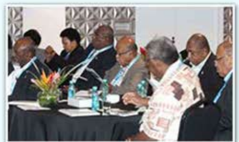
Members of Parliament attended a three-day professional development retreat on the role of Parliament in Extractive Industries in August, 2016.