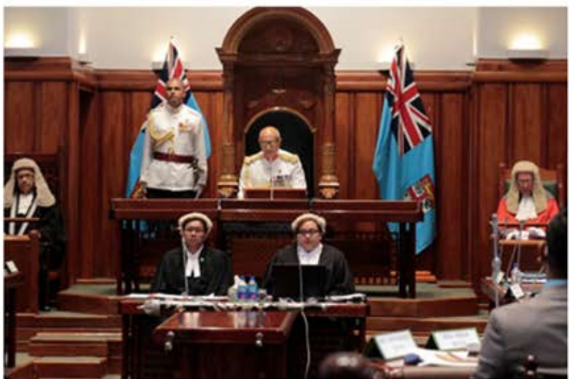
His Excellency, the President Major-General (Ret'd) Jioji Konrote delivering his keynote address during the opening of Parliament.

"All around us are the signs of revival and rejuvenation. Let us re-dedicate ourselves to the task of continuing to rejuvenate our nation and giving it the sense of direction and purpose it deserves."