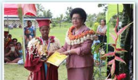
Hon. Dr Jiko Luveni with a student of Burebasaga District School in Rewa during their prize-giving ceremony in November, 2016.