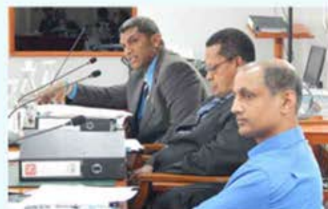
Public Accounts Committee meeting in progress in October, 2016.