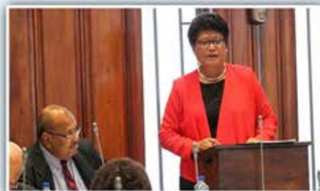
Hon. Salote Radrodoro asks a question during the Parliament Sitting in September, 2016.