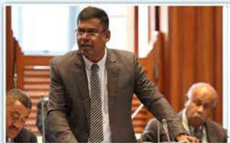
Opposition Member of Parliament Hon. Prof. Biman Prasad interjects during the Parliament Sitting in September, 2016.