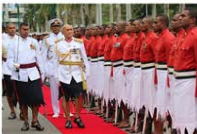
His Excellency, the President Major-General (Ret'd) Jioji Konrote inspects the Guard of Honor during the opening of Parliament.

"We are now a nation that is unified, more so than at any time in our entire history and we are a nation on the move," he said.