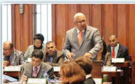
Hon. Prime Minister Voreqe Bainimarama responds to a question during the Parliament Sitting in September, 2016.