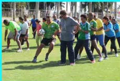
Parliament staff participate in a team bonding game during the Secretary-General Hour in September, 2016.