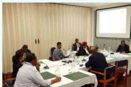
Members of the Standing Committee on Social Affairs receiving submissions from the Ministry of Education in October, 2016.