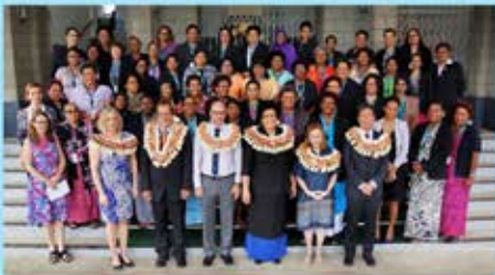
Participants of the Women's Parliament forum with Hon. Dr Jiko Luveni and representatives from the United Nations Development Programme (UNDP), European Union and the Governments of New Zealand, Australia, and Japan.

Fifty women from various backgrounds across Fiji gathered to be part of Fiji's first-ever "Women's Parliament Fiji" held from 16th-18th August 2016.