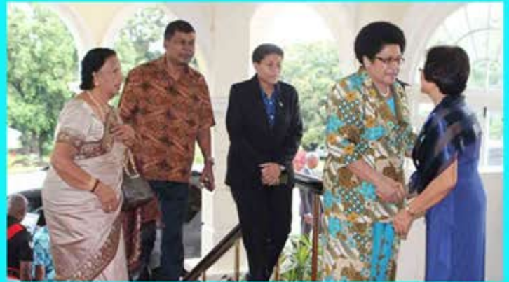
Fiji Day cocktail hosted by His Excellency the President Major-General (Ret'd) Jioji Konrote at Government House for Members of Parliament, Members of the Diplomatic Corps and other dignitaries in October, 2016.