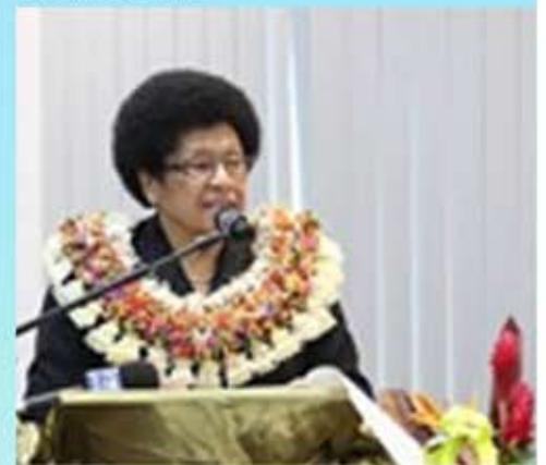
Hon. Dr Jiko Luveni delivering the keynote address during the opening of the Women's Parliament in August, 2016.

The Practice Parliaments are designed to bridge some of the gaps in the existing efforts to support women's political participation by developing a broader set of skills and by giving women participants the opportunity to apply those skills.