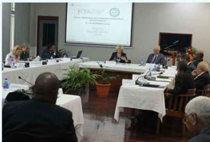
Members of the Standing Committees and Committees secretariat staff in a Standing Committee workshop facilitated by the Commonwealth Parliamentary Association (CPA) UK in November, 2016.