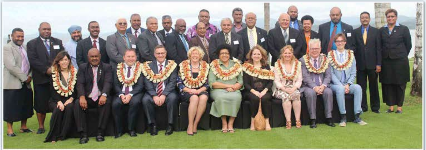
Members of Parliament with facilitators of the Standing Committees workshop from the CPA UK. The facilitators conducted the workshop for the MPs in November, 2016.