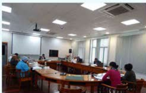
Members of the Standing Committee on Justice, Law and Human Rights receiving submissions from the Fiji Women's Rights Movement in October, 2016.