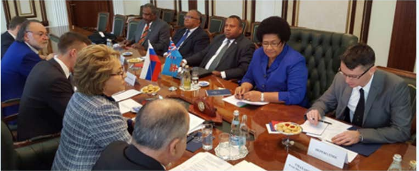
Speaker Hon. Dr. Jiko Luveni and her delegation meets with their Russian counterparts.

The Parliament of the Republic of Fiji and the Russian Federation Council, which is the Upper House of the Federal Assembly of Russia (Parliament of the Russian Federation), signed a Memorandum of Understanding in October, last year to strengthen their bilateral ties.