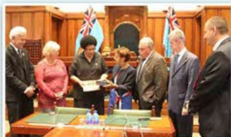
A French delegation courtesy visit to the Speaker of the Fijian Parliament Hon. Dr Jiko Luveni in September, 2016.