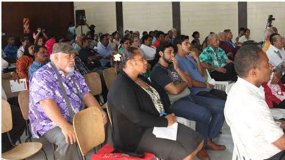
People from various walks of life attended the 4th Speakers Debate held at Nadi's Civic Centre on November 17th, 2016.

In its quest to promote sustainable and quality education in the country the Fijian Parliament in collaboration with the UNDP hosted the fourth and final Speakers Debate for 2016, at Nadi's Civic Centre on November 17th, last year.