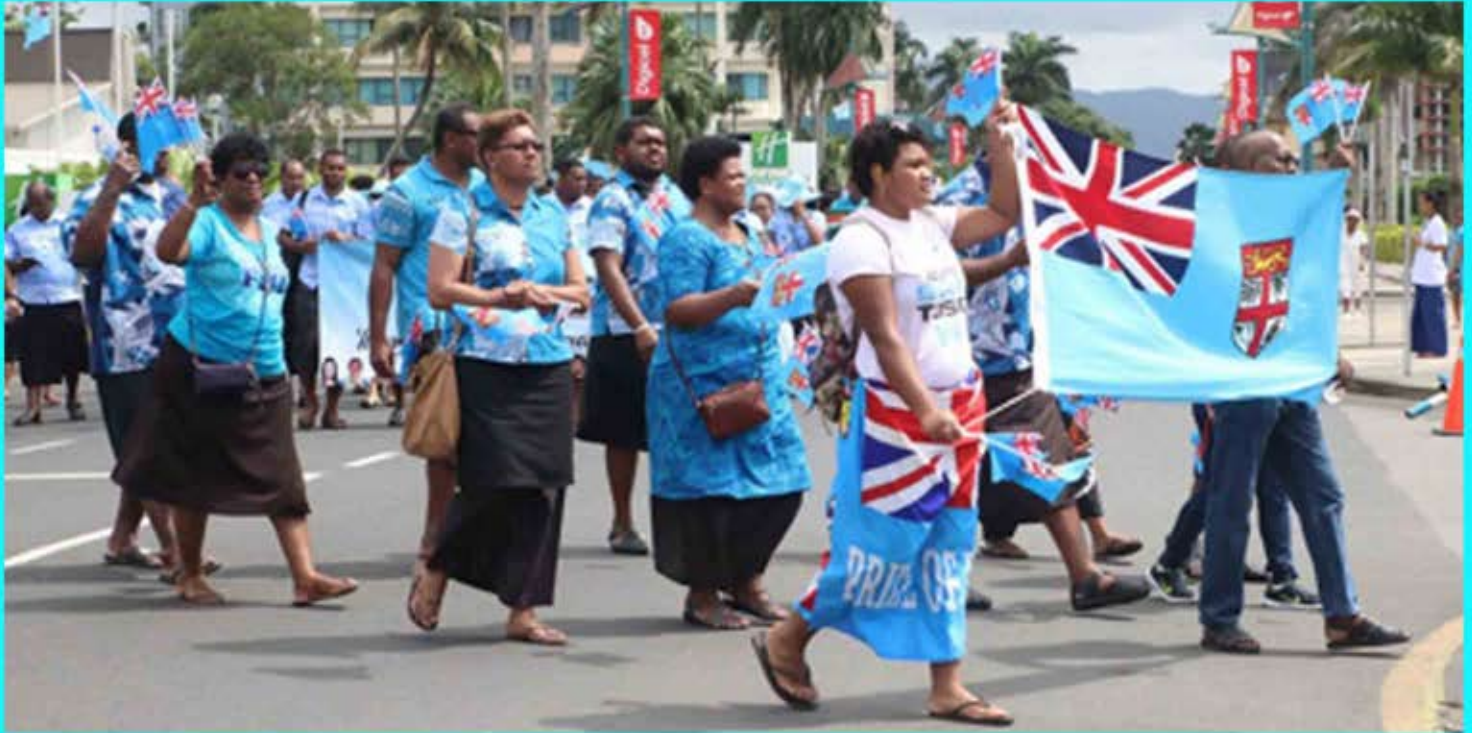
Parliament staff joined marchers who marched through Suva city to Albert Park on October 10th, last year to commemorate the Fiji Day celebrations.