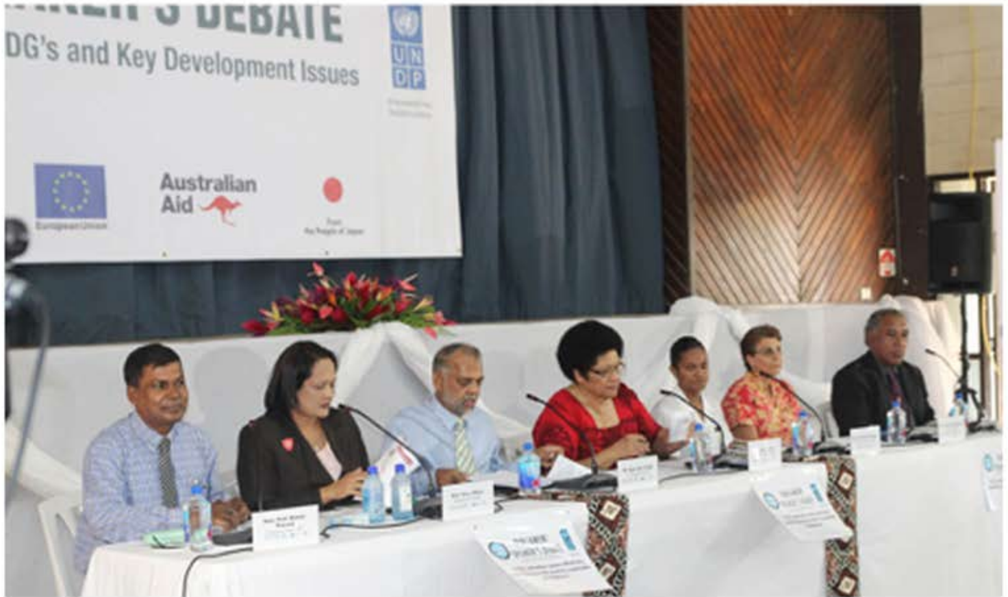
Panelists for the 4th Speakers Debate held at Nadi's Civic Centre on November 17th, 2016.