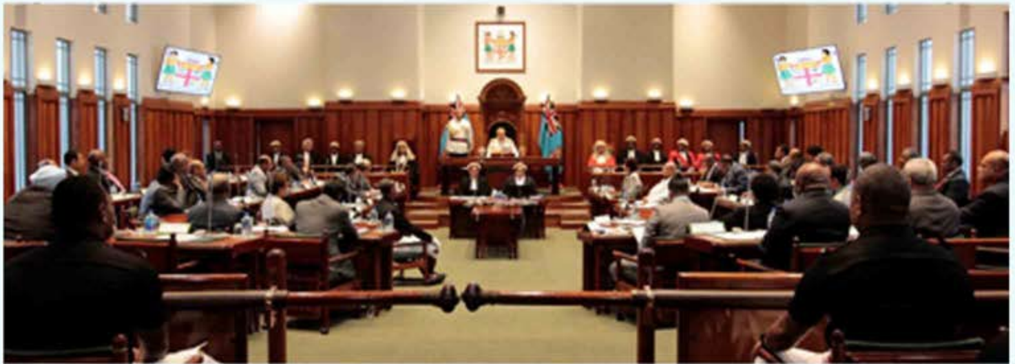
Opening of the 2016-2017 Parliament session in September, 2016.