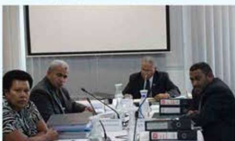
Members of the Standing Committee on Foreign Affairs and Defence during one of their committee meetings in November, 2016.