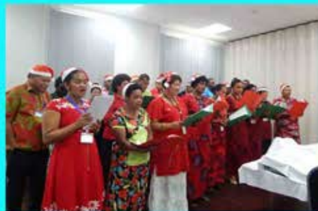
Some MPs joined Parliament staff for Christmas carol singing in December, 2016.