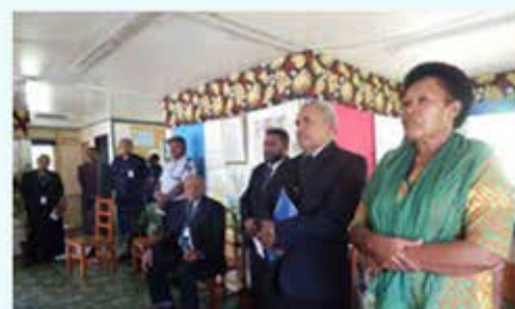
Members of the Standing Committee on Foreign Affairs and Defence during their tour of the Nasova Police Academy in December, 2016.