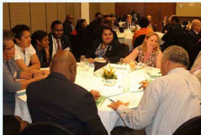
Members of the Standing Committees and Committees secretariat staff in a Standing Committee workshop facilitated by the Commonwealth Parliamentary Association (CPA) UK in November, 2016.