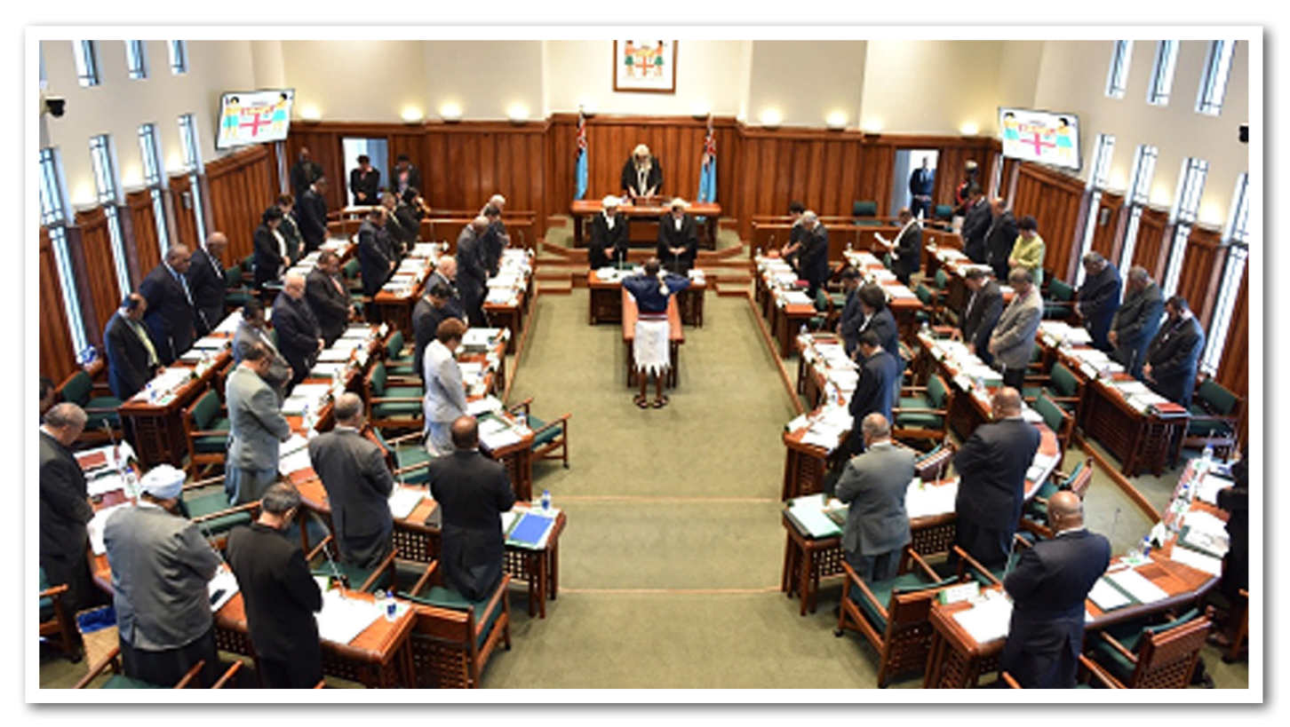
Prayer before Parliament sitting in February