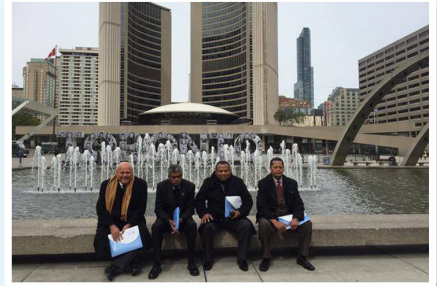
Parliament delegation on their way to Toronto City Hall as partly visible in the background.