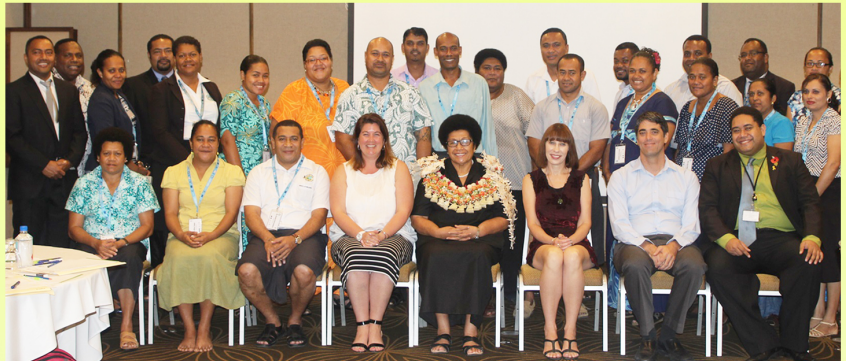
Participants and facilitators with Speaker of Parliament Hon. Dr. Jiko Luveni.

Teachers from around Viti Levu attended a two days' workshop which was coordinated by the Fijian Parliament with the support of the United Nations Development Program. The workshop, which was opened by the Speaker of Parliament, Hon. Dr. Jiko Luveni, was aimed at enhancing the knowledge of teachers on the roles of parliament which they teach in the education curriculum.