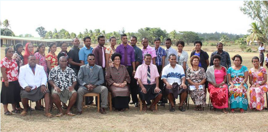
Speaker Hon. Dr. Jiko Luveni with staff and students of Lekutu Secondary School.

The Civic Education and Media Unit continued with its outreach activities in the second half of 2015, beginning at villages and schools in the Bua province. The main objective of the Parliament Bus programme is to bring Parliament closer to the people by informing communities and students about the role of Parliament and how they can be involved in the democratic process. Schools and communities covered in the Bua/Savusavu areas were: