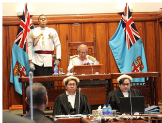
His Excellency the President, Ratu Epeli Nailatikau, delivers his Most Gracious speech when he opens Parliament for the last time as President, in September, 2015.

The new session of Parliament was opened on Monday, 14th September 2015 by His Excellency the President Ratu Epeli Nailatikau. In his last address to the Members of Parliament, the President reminded them to lead by example as the people have placed their trust in them to represent their interests.