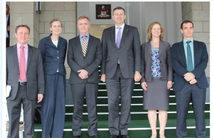
Joint Committee on Public Accounts and Audit from the Australian Federal Parliament with the Australian High Commissioner to Fiji and one of the First Secretaries.