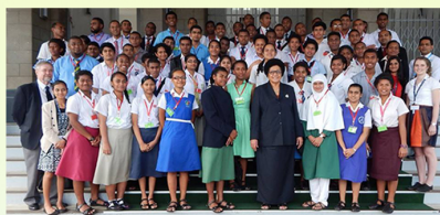
Participants and facilitators with Speaker of Parliament Hon. Dr. Jiko Luveni.