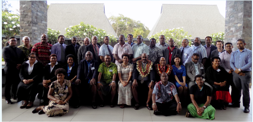
MPs retreat at the Inter-continental Resort.