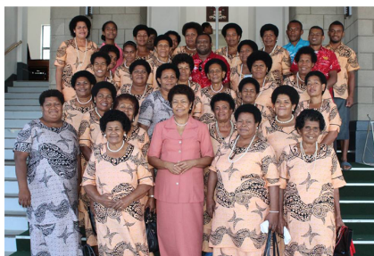
Leader of the Opposition, Hon. Ro Teimumu Kepa with a Women's Group from Savusavu during the group's visit to Parliament.