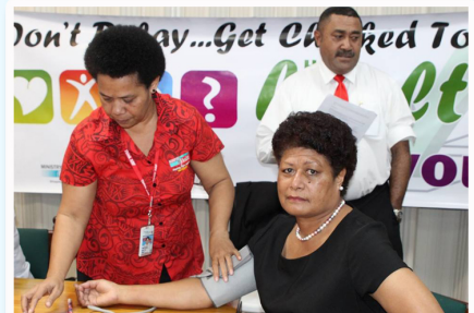
Members of Parliament undergo health check after a Parliament sitting.