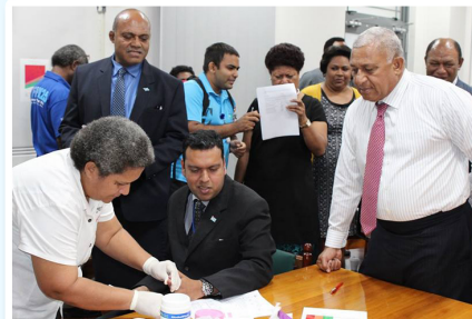
Members of Parliament undergo health check after a Parliament sitting.