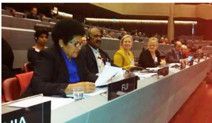
Fijian Parliament Speaker Hon. Dr. Jiko Luveni delivering her acceptance speech.

The readmission of Fiji has been welcomed by the organization as a significant step forward in ongoing efforts to cement democracy in the country and in IPU's engagement with parliaments from Pacific Ocean Island nations.