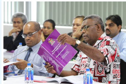
Budget awareness workshop for MPs.