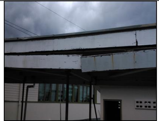
Figure 21.3 Repair on roof not done