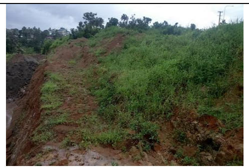
Figure 21.8 High Risk of Land Slide

The above finding indicated lack of proper planning on the part of the school in carrying out the project. In addition, it indicates lack of proper monitoring on responsible supervising officers to ensure that the work is conducted within the requirements of the MOU.