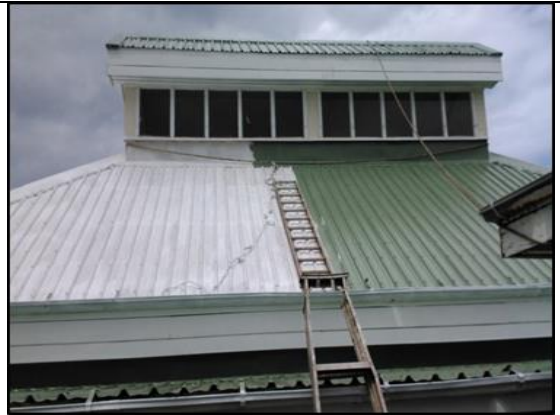
Figure 21.4 Roof of the Library not repaired

• No evidence existed to indicate that the School Principal provided weekly reports on the progress of the maintenance and upgrading works to the Director Asset Management Unit. In addition, there was no evidence to indicate that the Building Supervisor at AMU carried out any site inspection of the progress of maintenance and upgrading works. Thus the directive given by the building supervisor to make progressive payments is highly questionable as this was made without prior verification of the progress of works carried out.