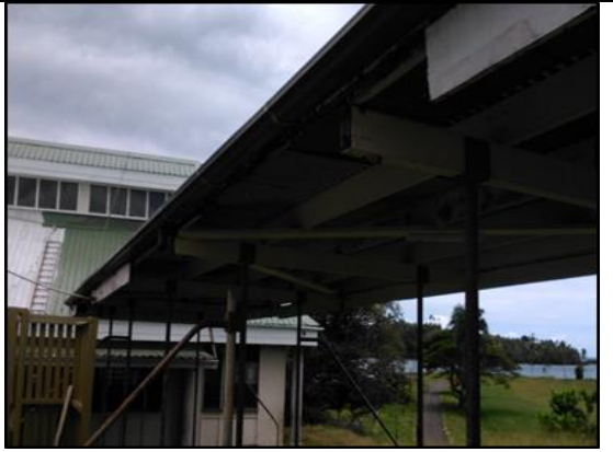
Figure 21.2Walkway not repaired